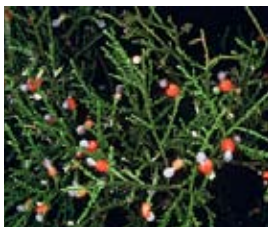
Kahikatea bark and foliage