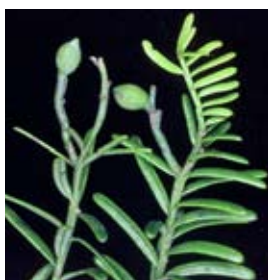
Mataī bark and foliage