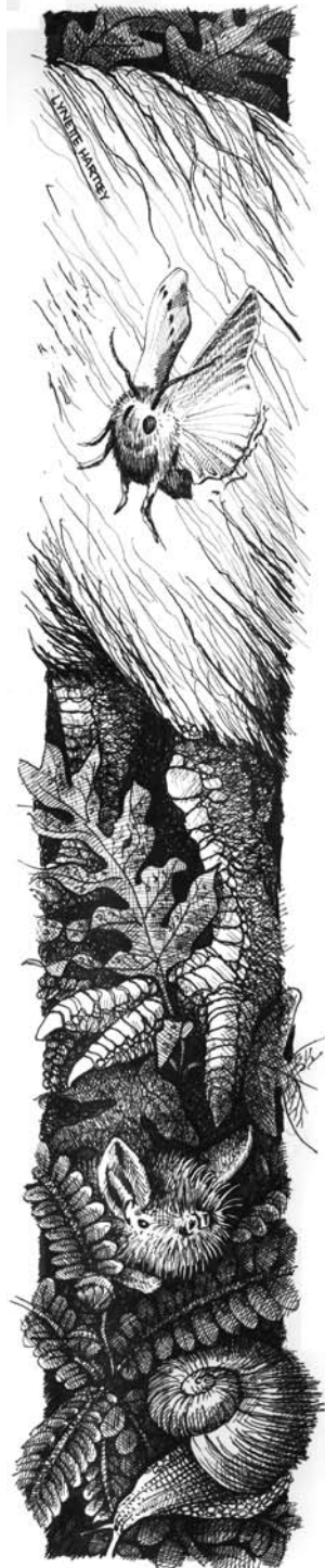
Illustrations: L. Hartley

During the coldest parts of the ice ages sea levels were about 120 m lower than present day levels because so much water was locked up as ice (mainly in the great ice-caps of the northern hemisphere). The North, South and Stewart Islands were then all joined as one land mass.