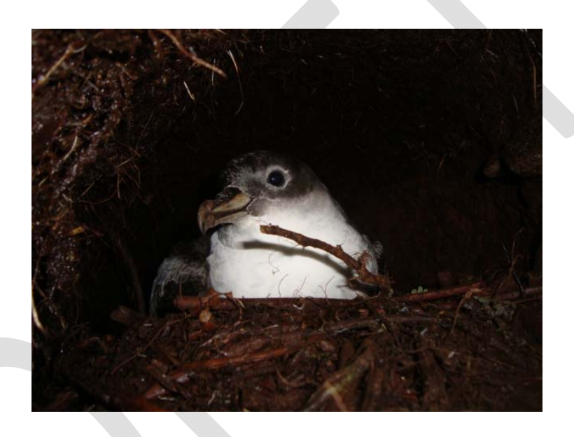
Report to the Department of Conservation June 2015