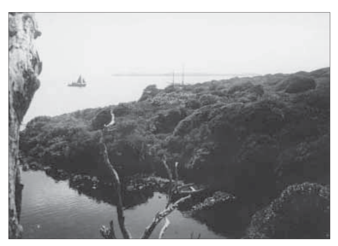
Ranui and New Golden Hind in Port Ross, January 1944.

The auxiliary ketch New Golden Hind was requisitioned in early 1943 as the supply vessel for Aerodrome Branch stations in the Pacific. In 1944, the year of my own relief, she replaced the Tagua as expedition transport vessel. That year the Aerodrome Branch wanted to produce a current map of the Auckland Islands, so a survey party of three joined the expedition. At this stage of the war coastwatching was considered much less urgent, and the two Auckland Islands stations were reduced to four men, freeing up facilities and accommodation for the surveyors. The survey party, under Flying Officer Allan Eden, based itself mainly at the Port Ross (No. 1) Station but used the Carnley Harbour (No. 2) station as required. As well as heading the survey, Flying Officer Eden was in overall charge of our relief.