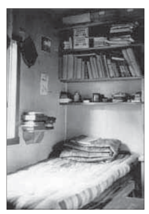
Home for a year the author's bunk and belongings.

Bob Falla's first task was to introduce us to the coastwatching Lookout. It was reached by half a mile of partly corduroved track. On the way we took in our first detailed view of the local landscape; the tall rata forest around the station soon gave way to more patchy forest and scrub, and at several points the track crossed open lanes ('clears') leading up through scrub to the tussocky tops. Two conspicuous landmarks were a flat-topped knoll to the south, Meggs Hill (374 feet or 114 metres) and, to the southwest, Mt Eden, which rises fairly steeply (to 1361 feet or 415 metres) and is topped by a distinctive 50-feethigh [16-metre] rocky knob. The Hooker Hills (reaching 1509 feet or 460 metres) lay to the west of the Lookout track.