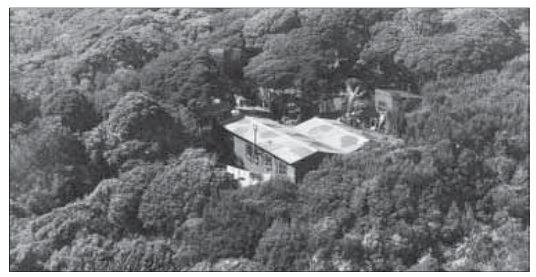
Above and right: No. 1 Station, Ranui Cove.