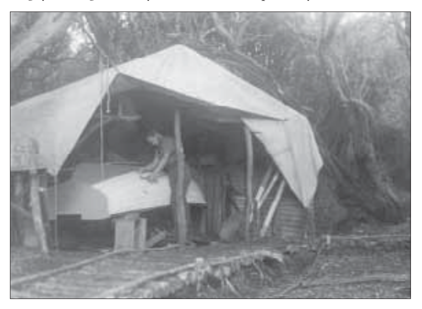
George Easton working on he boat, No. 1 Station.

We had two dinghies; the new 14-footer [4.6 metres] that came down in the Hind immediately proved herself perfectly suited to our requirements. She was well-built but light enough for three—or in an emergency even two of us—to beach readily or pull up on the slipway; and with her 5ft 3in [1.6 metre] beam she had excellent stability if we were caught offshore in a sudden squall. The old 12-foot [3.9-metre] dinghy, although still fully serviceable, was kept mainly as a reserve craft.