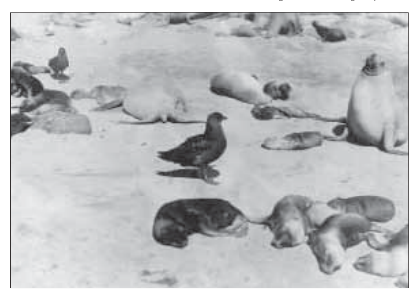
Sea lion pups and females, and skuas, Enderby Island.

The Hind motored out of the bay and quickly made sail, disappearing round Enderby's eastern point. We were to see her again in about a fortnight on her return with the new No. 3 (Campbell Island) party.