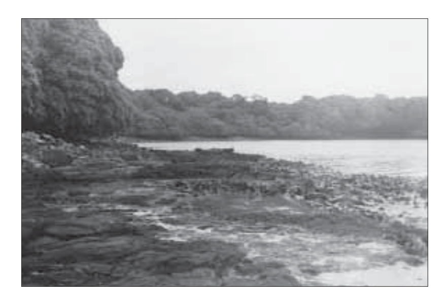
Landing beach, Ewing Island.

It was a fine afternoon with a good southeasterly breeze and although Captain Webling was impatient to leave for New Zealand, he agreed to delay departure for a few hours while the combined parties went ashore. The Bay curves east and west for 600 yards [550 metres] on Enderby's south coast: such a stretch of flat, open sand is unique on the otherwise rock-bound Auckland Islands and therein lies its attraction as the ideal hauling-out site for the sea lions' breeding season.