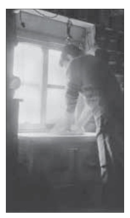
The author making bread.

150 tins of jam if he had ever produced a recognisable product.