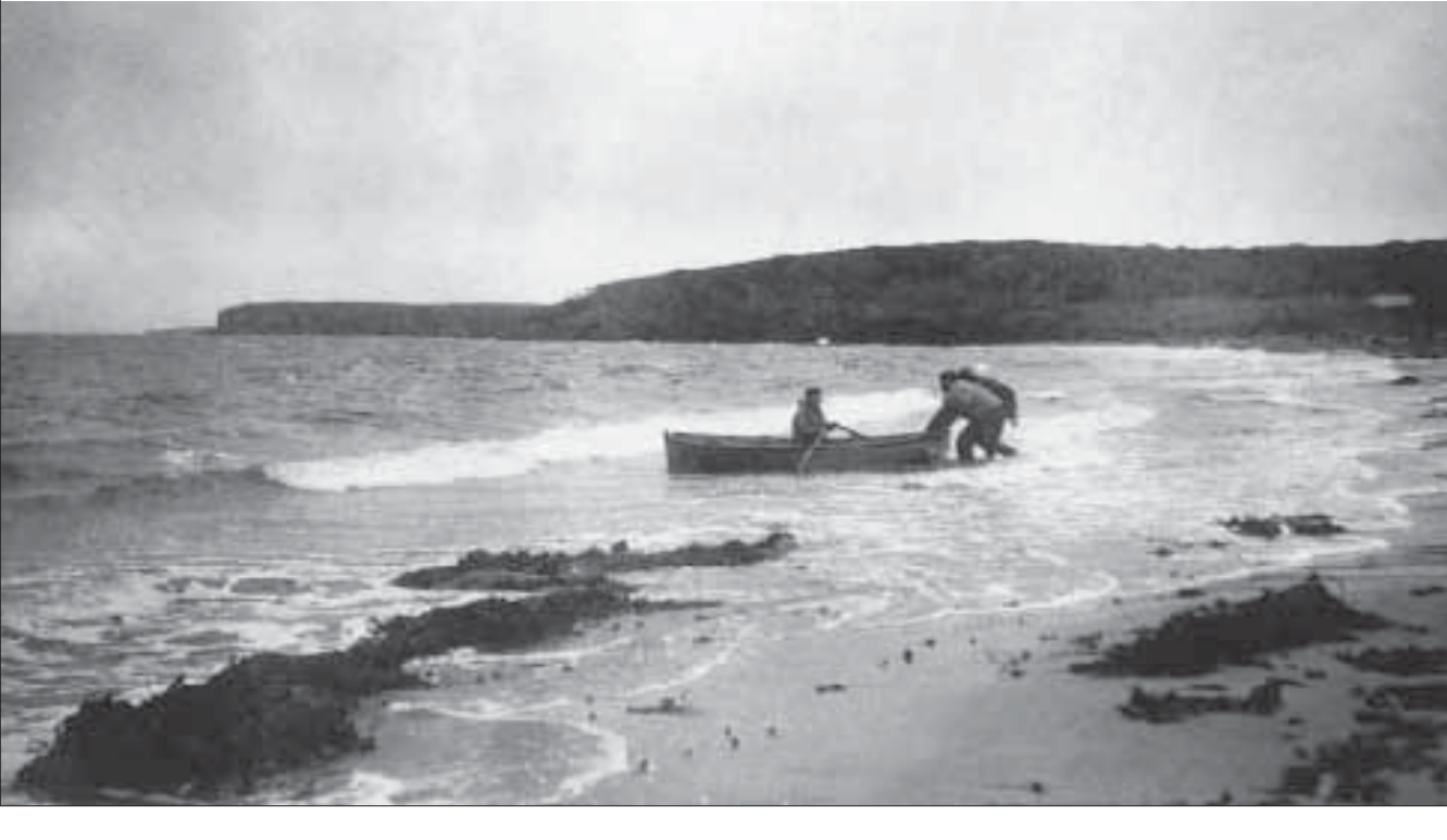
Landing on Sandy Bay, Enderby Island.

We quickly realised the colony was divided into a number of distinct, compact groups. In the centre of each was a massive dark-brown bull and clustered closely round him up to 30 much smaller and more slender pale-fawn females (known to the sealers as 'sea bears'). These groups—the 'harems'—had been formed earlier when the females arrived and attached themselves to one of the dominant territorial males (the 'beachmaster' bulls). We could see these beachmasters had no chance of relaxing their control over the harem; on the outskirts were equally large males ready to challenge and supplant them. Yet amazingly enough, in view of so much fighting and challenging, the pups born in the harem rarely fell victim to the constant aggression of the huge males, by whom they could easily have been crushed to death.