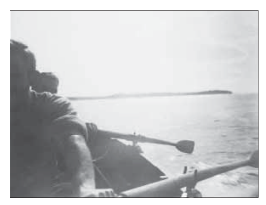
Rowing to Ewing Island, Port Ross.

when euphemistically labelled 'spiced mutton' or 'corned beef') than for the combinations of really excellent canned vegetables we managed to produce. For the first few months—and after the Ranui's mid-year visit—we had fresh vegetables in quantity; these were stored in cool, shady conditions in a tent at the landing and most, especially the potatoes, kept well. We brought a supply of eggs with us, as did the Ranui when she came down at mid-year. Each supply lasted several weeks.