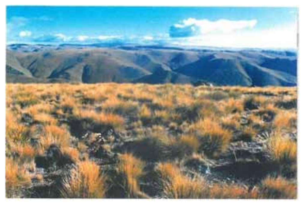
Figure 2: Long Spur, Ida Range looking west over the large block of plateau country.