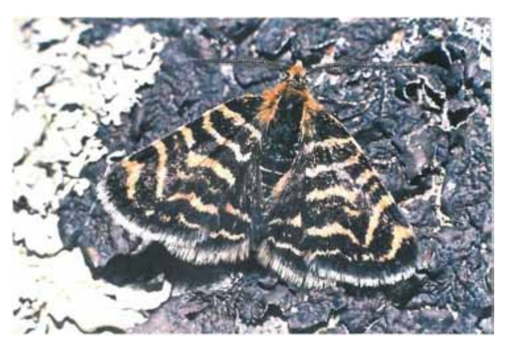
Figure 3: This diurnal new species in the genus Notoreas frequents fellfield and open areas where Kelleria villosa , the larval hostplant exists.