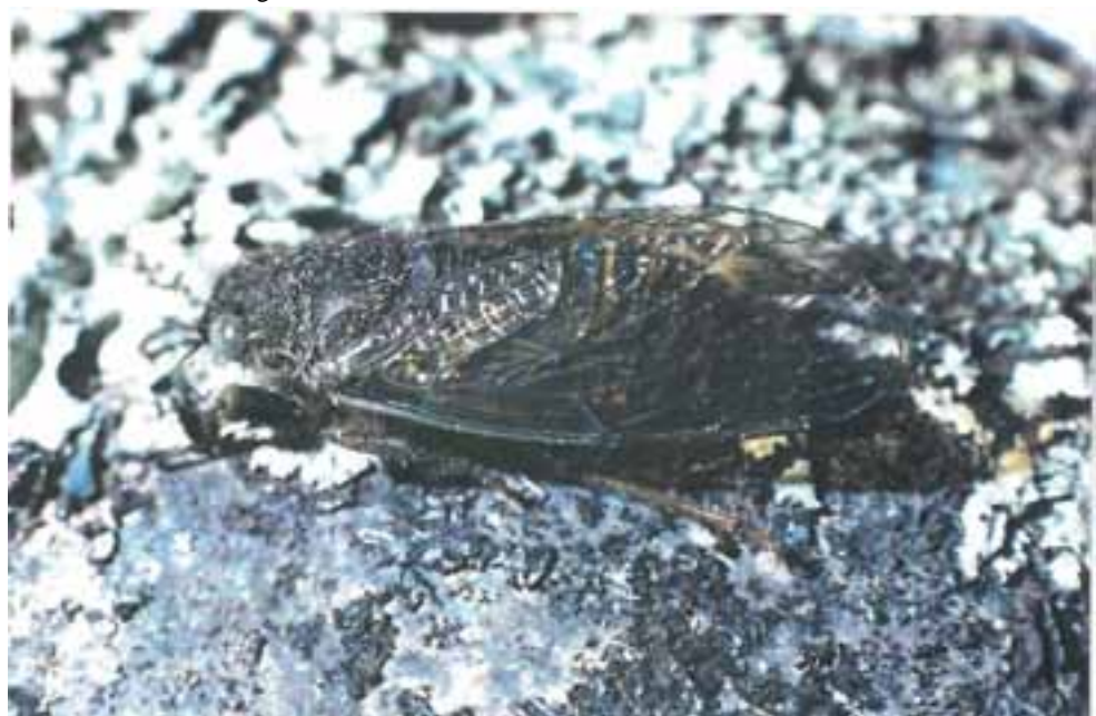
Figure 5: Maoricicada phaeoptera is conspicuous by its singing male in high alpine parts of the Hawkdun and Ida Ranges.