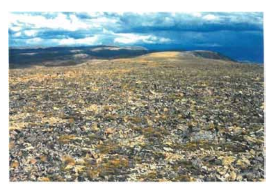
Figure 7: Fellfield on the crest of the Hawkdun Range at 1860 m looking south-east to Mt Ida. 1992. Flat shrubs of Dracophylluin inuscoides dominate the vegetation. February 1992. Figure 8: Large cirques containing wetlands and tarns are found immediately east of the crest (above). Chionochloa macra is present over large areas.