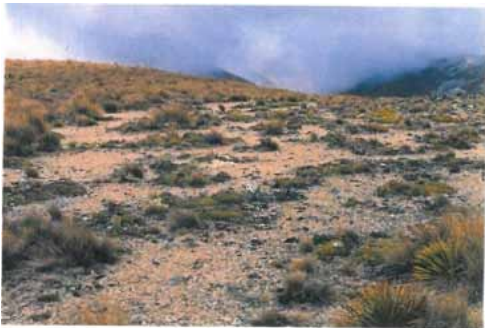
Figure 4: Naturally open areas are common on greywacke substrate. This one east of Mt Ida, at 500 m on Long Spur.