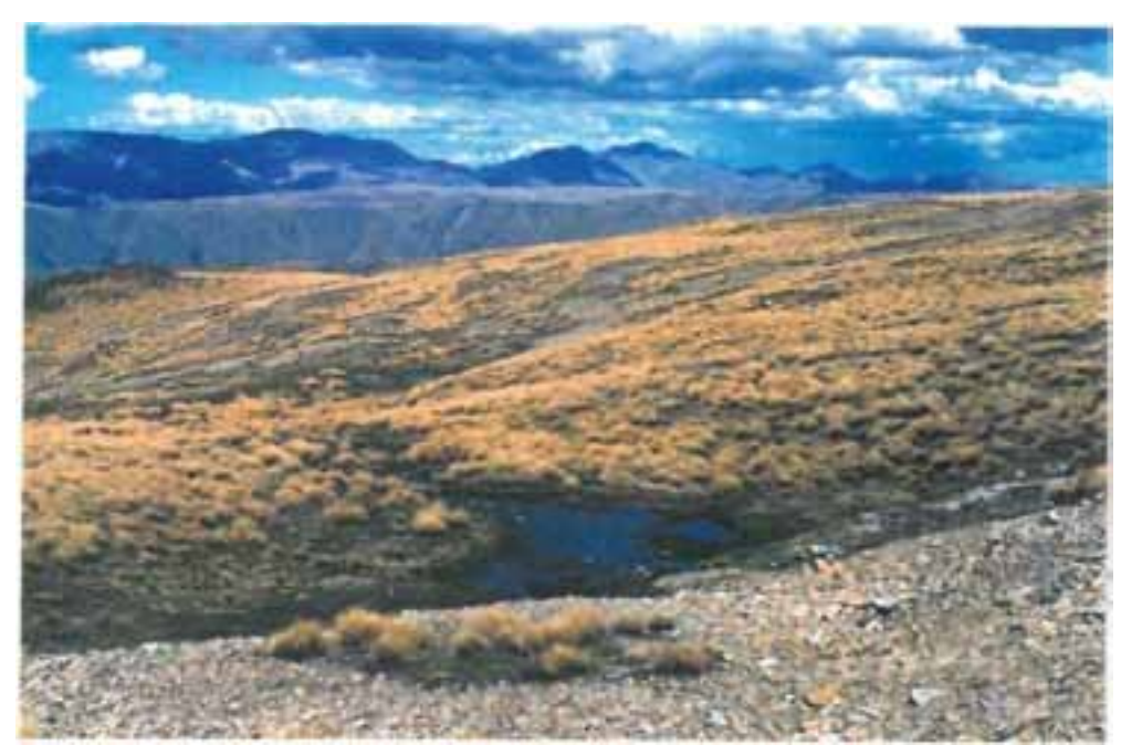
Figure 9: Wetlands, tarns and streams beginning on the eastern side of the Hawkdun Range at 1820 m. St Marys Range in background. February 1992.