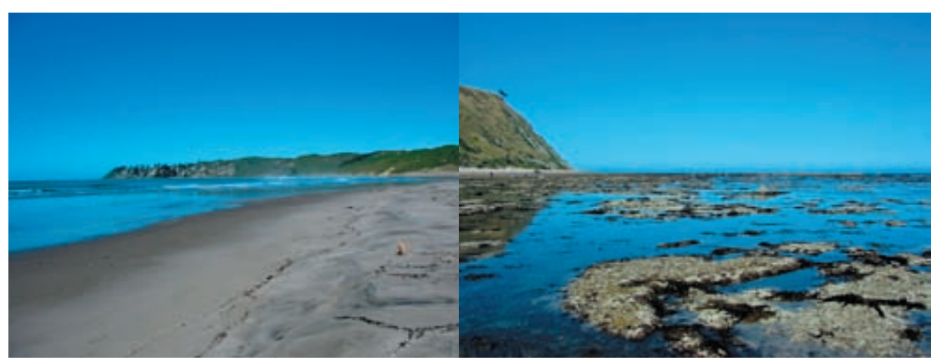
Looking south to Kaiora from Whangara