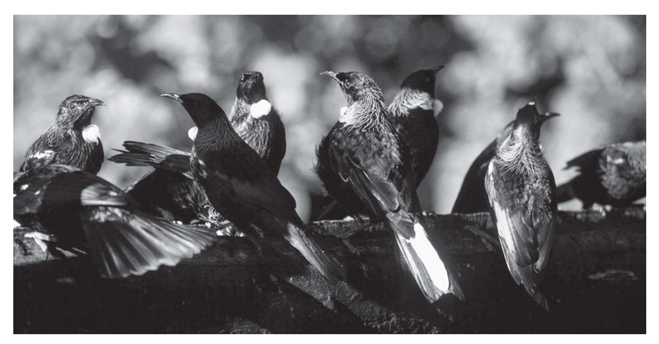
Tui on drinking trough.

expected to take about three years, with two staff being employed fulltime to carry out the field work. The first phase, taking about a year, will involve seasonal visits to sites such as small and large native forest patches, forestry plantations, farmland and residential areas, to see whether tui and kereru are present. Various characteristics of each site will be recorded, such as habitat type, presence of food plants, distance to closest forest patch, and proximity to dwellings. This will be followed by a two-year study of selected radiotagged birds to determine individual movements, their foods, when and where they nest, and how successful they are at rearing their young. We hope that the information obtained will help various organisations and groups, such as the Department of Conservation, councils, iwi, landcare groups and private individuals, to ensure the long-term presence of these two important native birds in rural and urban Southland, and in other regions of New Zealand.