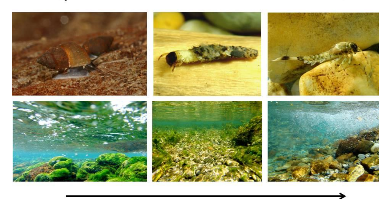
Increasing disturbance pressure

Figure 1. The opposing forces of disturbance pressure from flooding and grazing by invertebrates contributes to the regulation of periphyton communities in many streams. Top panel from left to right: the snail, Potamoprygus antipodarum ; cased caddis Pycnocentrodes sp.; and grazing mayfly Nesameletus sp. Bottom panel from left to right: typical stream bed scene from a stable spring-fed stream; intermediately disturbed lowland stream bed; and highly disturbed alpine river.