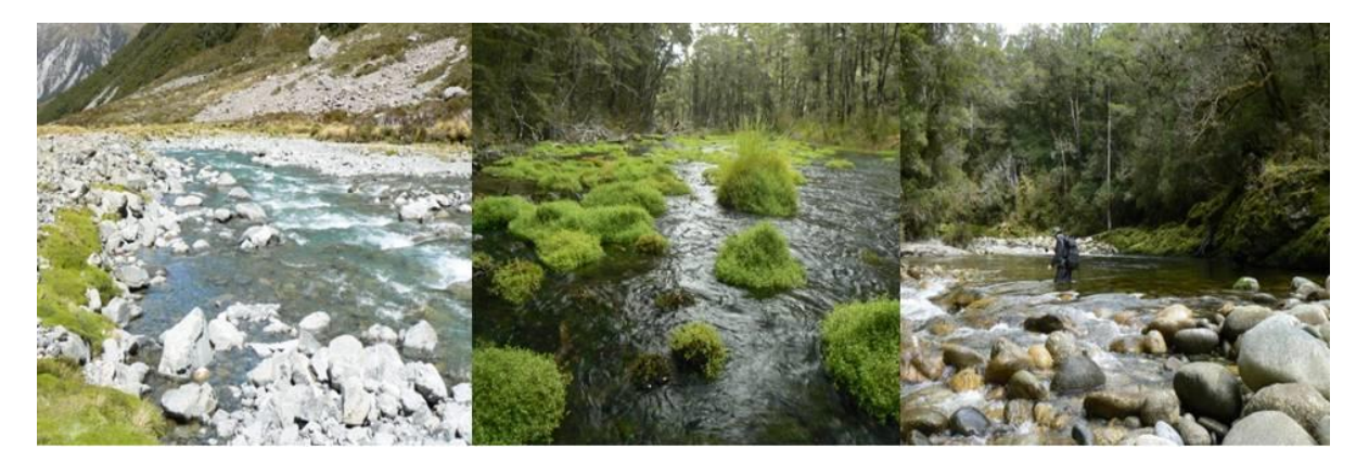
Figure 3. From left to right: typical riffle, run, and pool (grading into riffle) habitat.

Biggs & Kilroy (2000) suggest that periphyton samples should most commonly be collected from 'runs' which are less prone to scour.