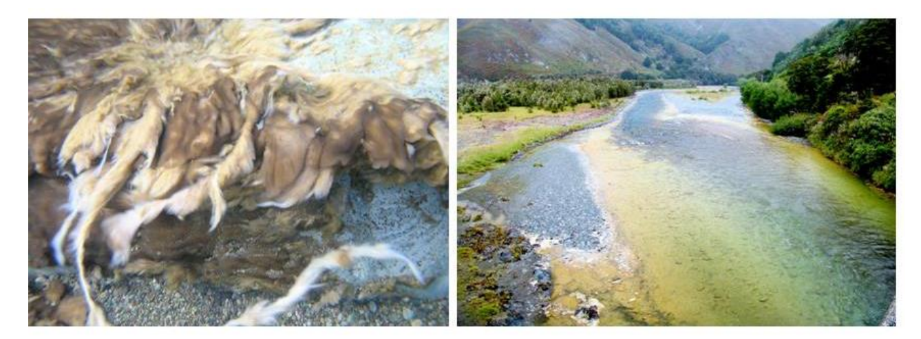
Figure 3. Left: mature growths of didymo adhere to benthic substrates. Right: Didymo covers the bed of the upper Buller River, Westland.

When undertaking water sampling for didymo, specific sampling protocols should be applied.<sup>3</sup>