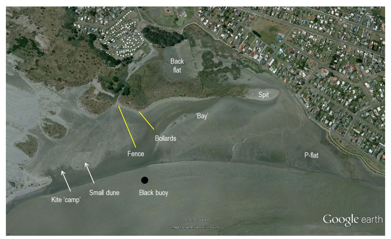
Figure 1. Map of the Manawatu Estuary, showing main reference points used during monitoring.