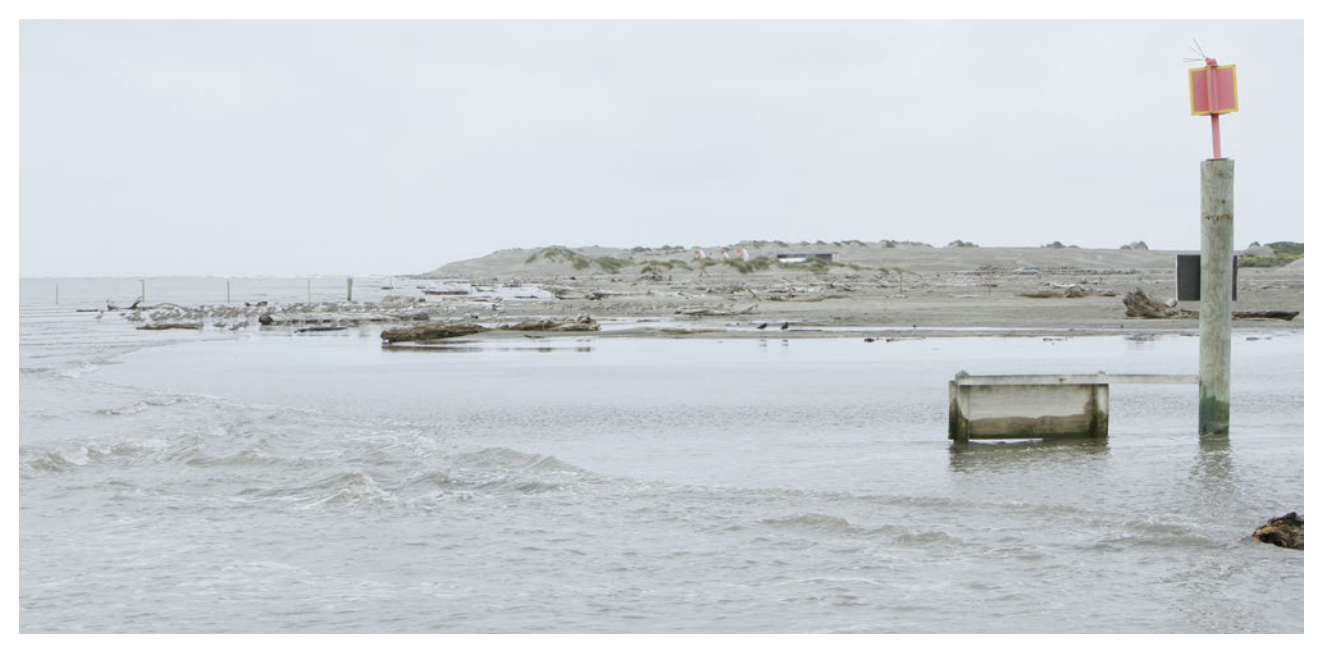
Figure 2. The shorebird flock roosting between the bollards and the temporary fence on 11 November 2015. The kite boarding event site is visible behind the small vegetated dunes in the foreground.