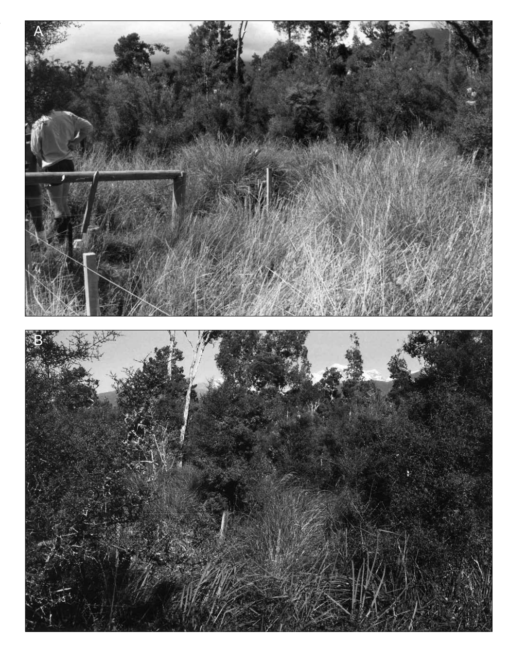
Figure 3. A pair of photographs looking across the northeast corner of the Cook Swamp exclosure into the control plot, showing A. the open grassland and ecotone in 1990; and B. the recruitment of shrubs and trees by 2002.