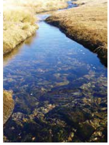
Deep Stream.

A series of hydroelectric stations were built in the Waipori Gorge by the Dunedin City Council. These water races were used to maximise the catchment of the Waipori River. An intake structure and tunnel at the top of the Eldorado Track takes water from the Deep Stream headwaters into Lake Mahinerangi.