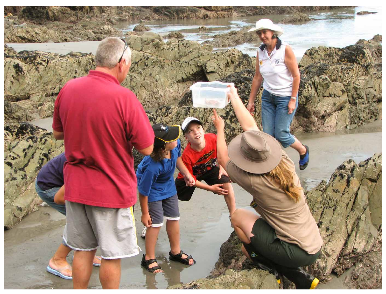
DOC ranger showing adults and children a crab during the Rocky Shore school field trip, Coast Road, Buller District.