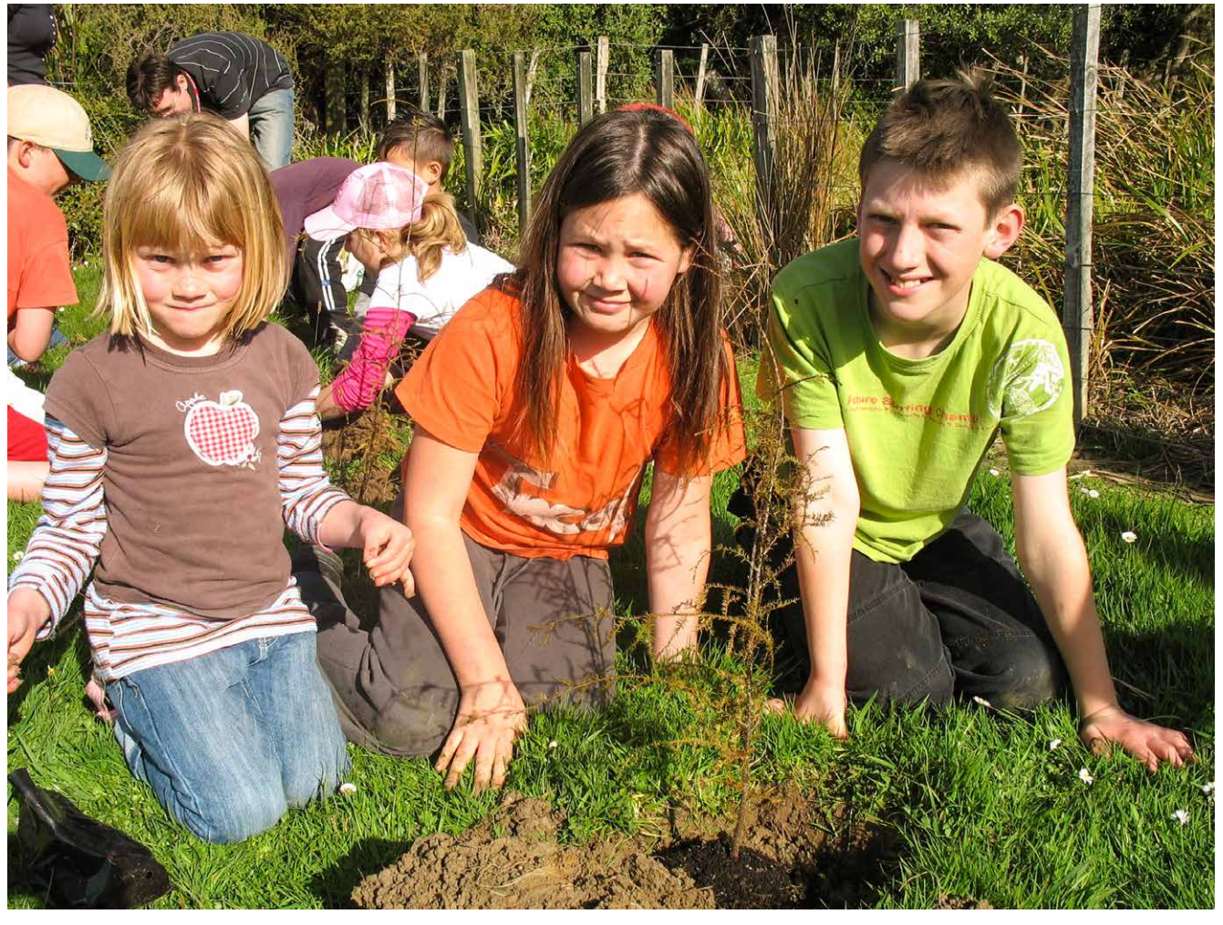
Schoolchildren from Pongaroa planting trees on the school grounds.