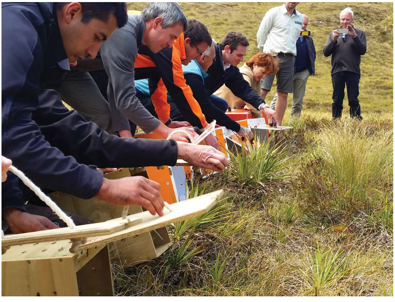
Takahē release in the Murchison Mountains.