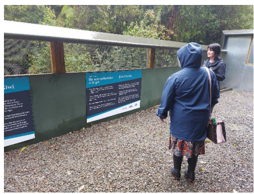
Figure 4: Kiwi Creche