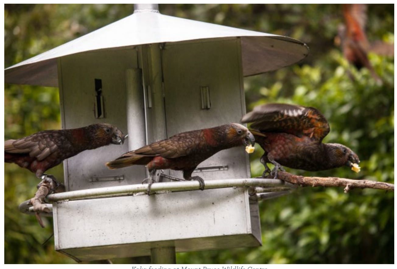
Kaka feeding at Mount Bruce Wildlife Centre