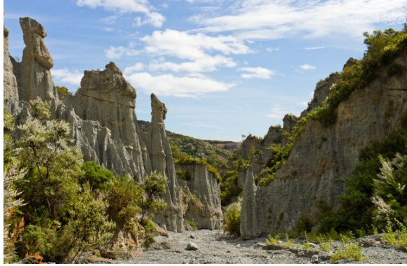
Figure 6: Putangirua Stream, Pinnacles Scenic Reserve, Wairarapa