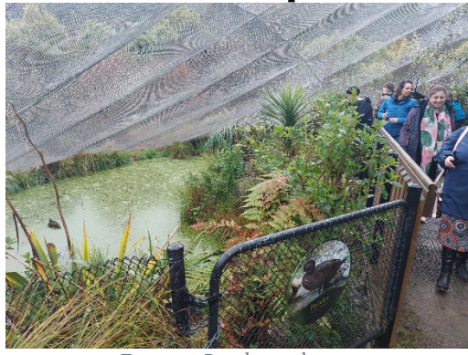
Figure 3: Pateke enclosure