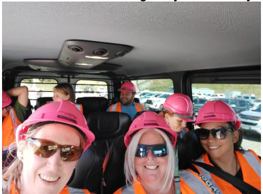
Figure 5: Hardhats and Safety Gear needed here