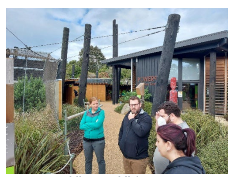
Figure 2: Wildbase Wildlife Recovery Centre