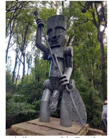
Figure 1: The Whatonga steel sculpture sits at the top, halfway point of the Tawa Loop Track, above Te Āpiti - Manawatū Gorge. The walk starts at the Ashhurst end of the Gorge

Manawatu Gorge Visit – July 2022 Board Field Trip