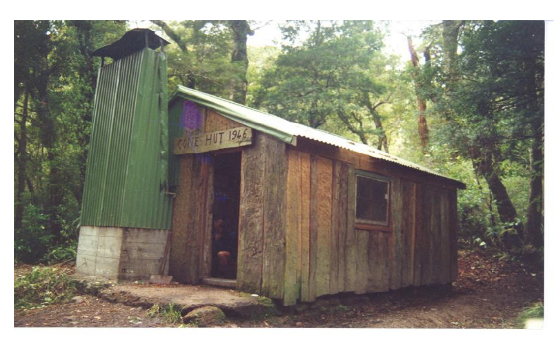
Photo: Cone Hut, the second oldest hut in the Tararua Forest Park Photographer: Richard Nester