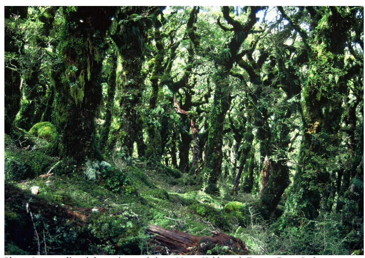
Photo: Interior of beech forest showing lichens, Mount Holdsworth, Tararua Forest Park, Photographer: Lindsey MacFarlane

Wellington Te Rūnanga Papa Atawhai o Te Upoko o te Ika Conservation Board