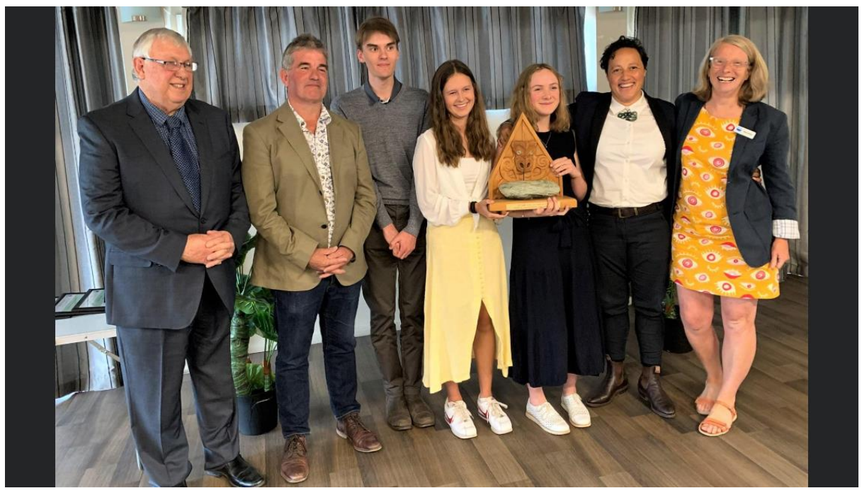
Te Waka o Aoraki Winners 2020

Glentanner Park (Mt Cook) Ltd Holiday Park and Activity Centre sponsored a new category for the best school-based conservation project. This was awarded to Burnside Primary School for the Canterbury boulder copper butterfly garden.