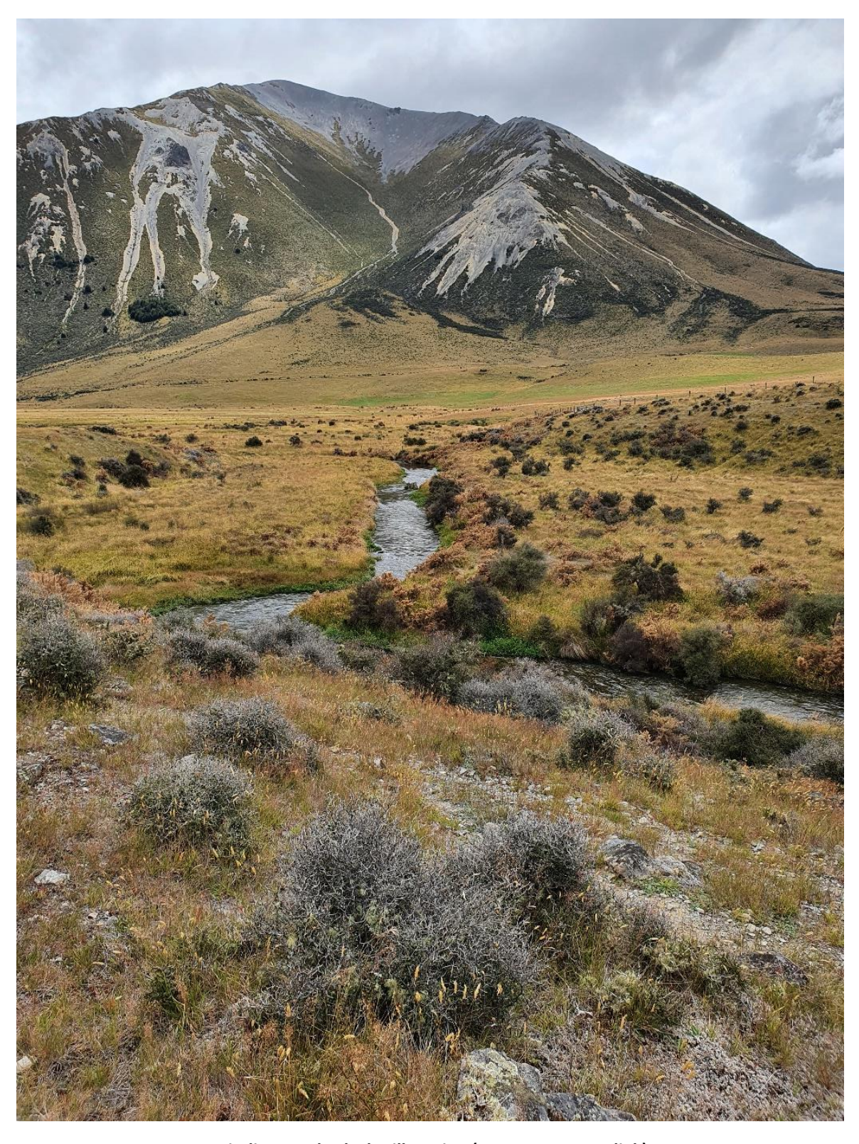
Winding Creek, Flock Hill Station (Image: M-L Grandiek)