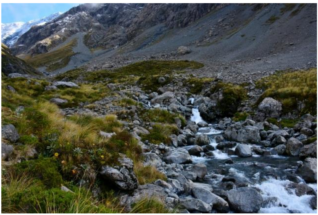
Otira Valley, Arthur's Pass National Park

The Arthur's Pass National Park Management Plan was approved by the New Zealand Conservation Authority in December 2007. It was due for review in 2017, but this has yet to be commenced by the Department. The Department presented an annual report to the Board on the existing Management Plan in October 2020. (See Chairpersons Report prev.)