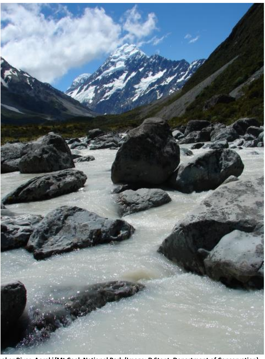
Hooker River, Aoraki/Mt Cook National Park

The process for reviewing the Aoraki/Mt Cook National Park Management Plan was paused while the Department and Ngāi Tahu worked through the wider implications of the Supreme Court's decision on the Ngāi Tai ki Tamaki case. Agreement has now been reached to start a new review of the Management Plan. The Board is currently working in consultation with Ngāi Tahu and the Department on reviewing the Management Plan and drafting a document to ensure the natural, cultural, heritage and recreational values of the National Park are protected for all. The Department presented an annual report to the Board on the existing Management Plan in October 2020. (See Chairpersons Report prev.)