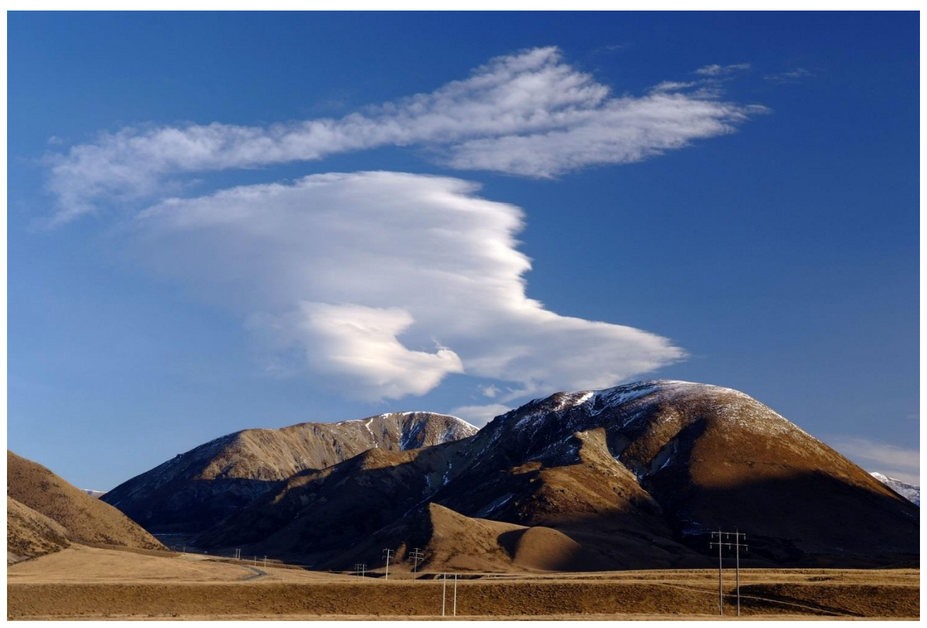
Selwyn District, Canterbury