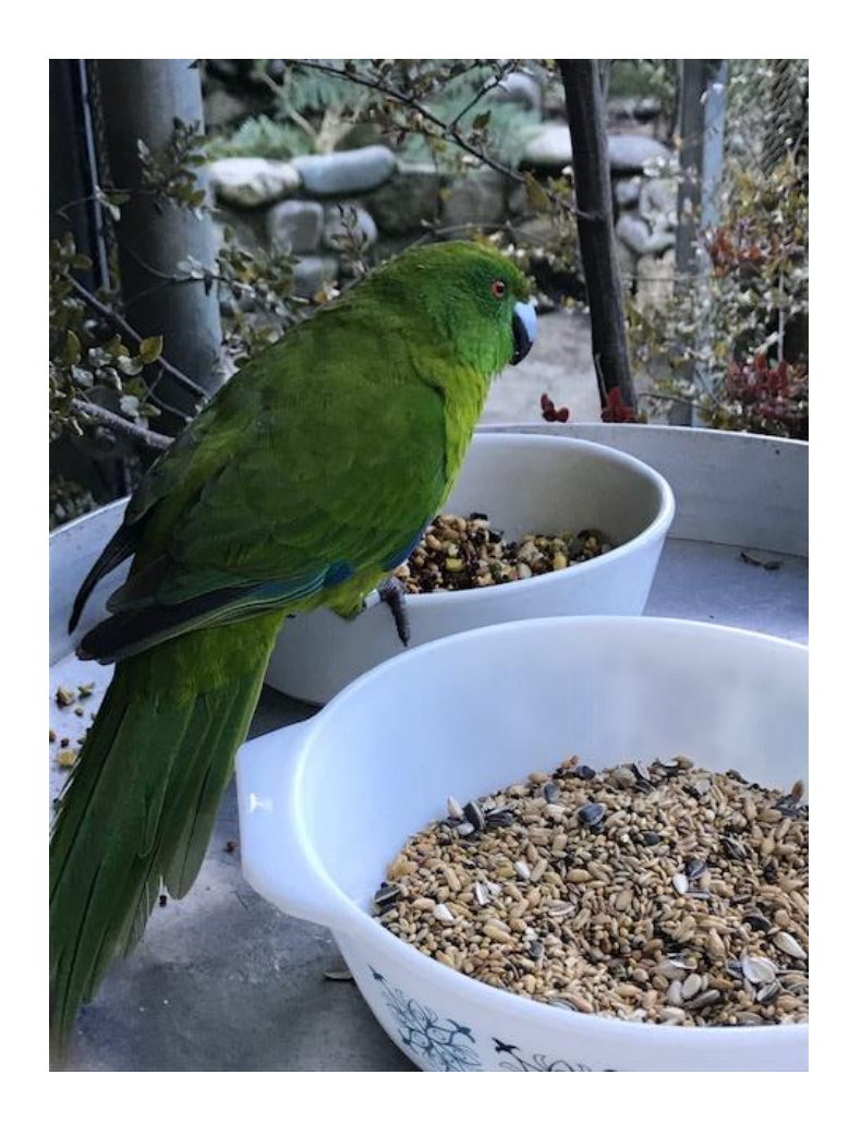
Kākāriki

The Board maintains a presence on the Department's website with updates provided throughout the year on activities undertaken. The Board also maintains a presence on both Twitter and Facebook.