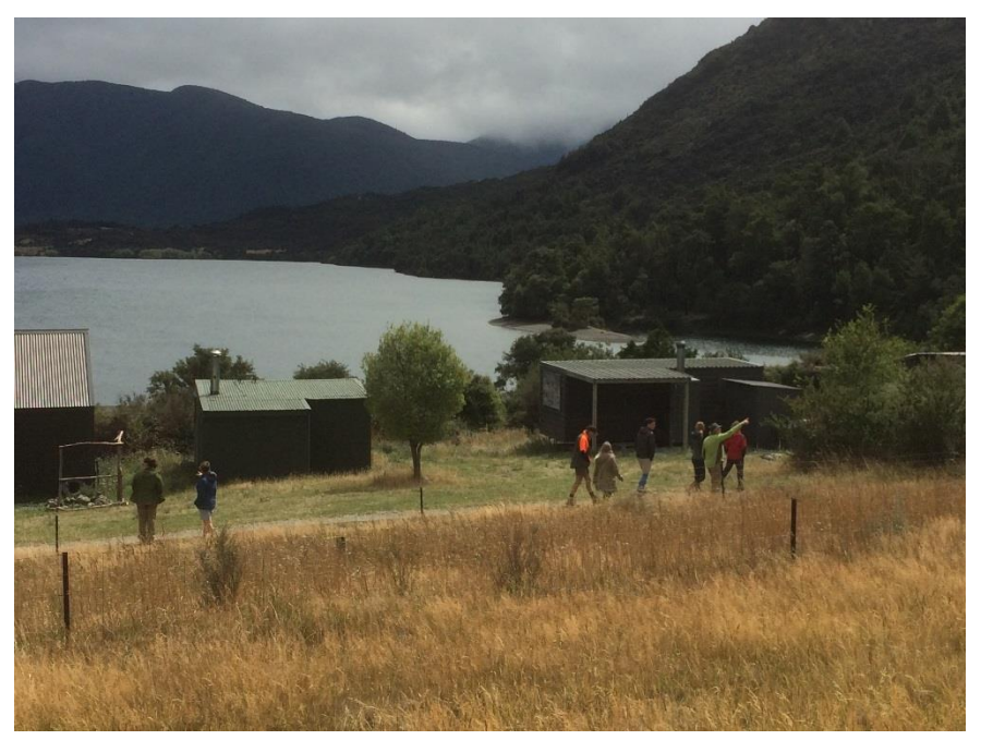
Loch Katrine, Lake Sumner Forest Park

The Board's focus for the field trip was to familiarise themselves and increase their understanding of the particular issues facing the Department's work in relation to the Canterbury (Waitaha) Conservation Management Strategy (CMS) for Loch Katrine. Of interest were the Policies and Milestones for Loch Katrine (p. 67 and 69, CMS); and Milestones-Outputs (p. 71, CMS) to be achieved by the end of Year 5 after CMS approval (2021).