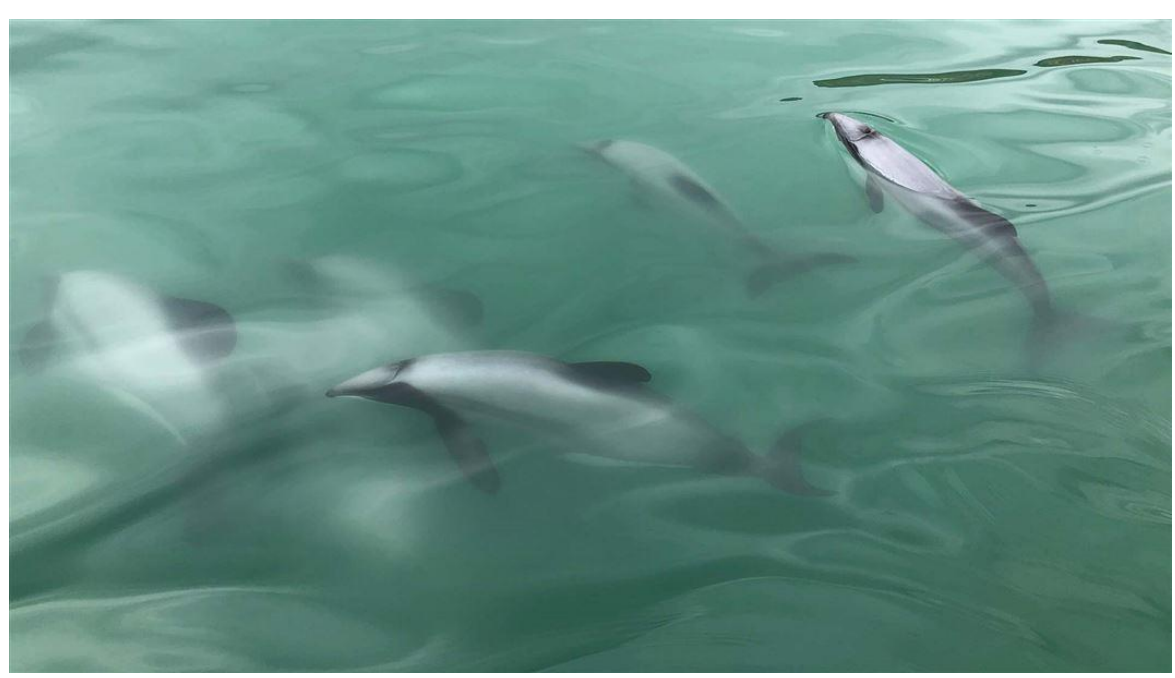
Māui Dolphins