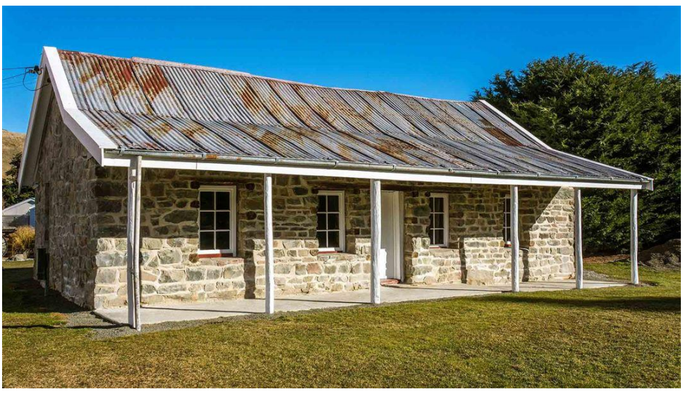
Hakatere Station buildings