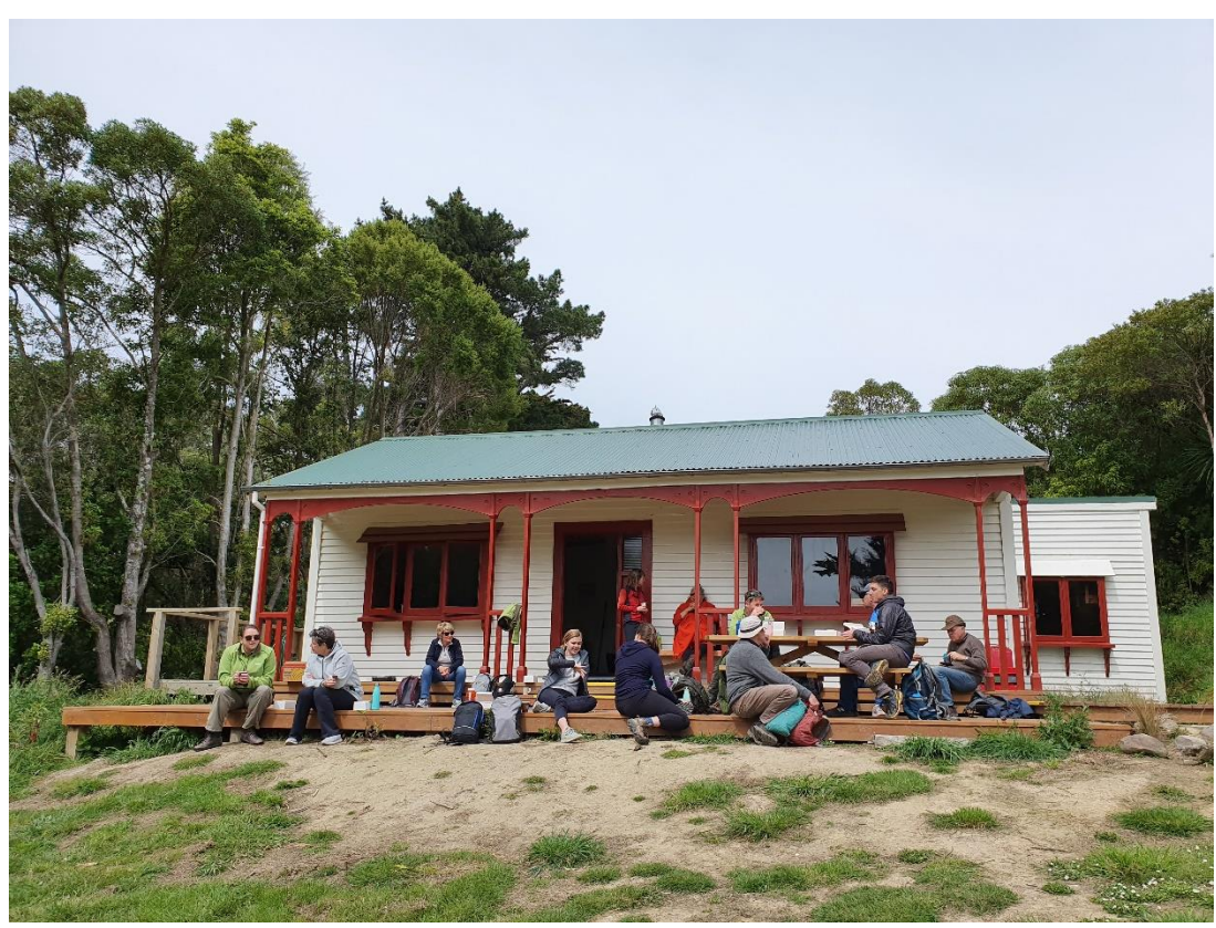
Ōtamahua Hut