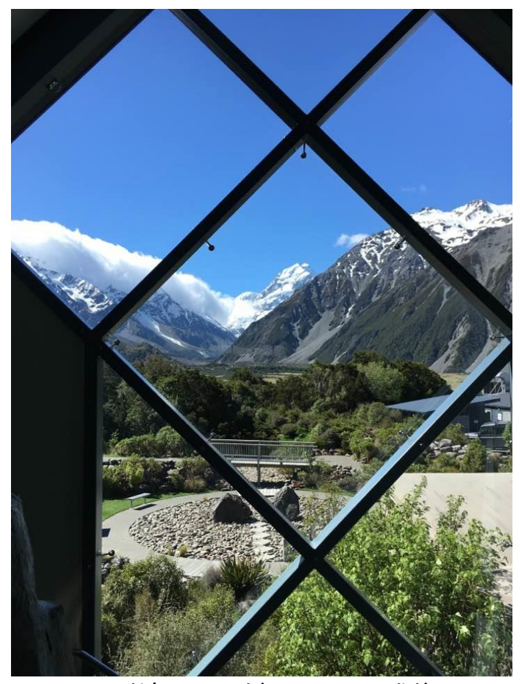
Aoraki / Mount Cook

The Board looks forward to resuming consultation with Ngāi Tahu and the Department on reviewing the Management Plan and drafting a document to ensure the natural, cultural, heritage and recreational values of the National Park are protected for all.