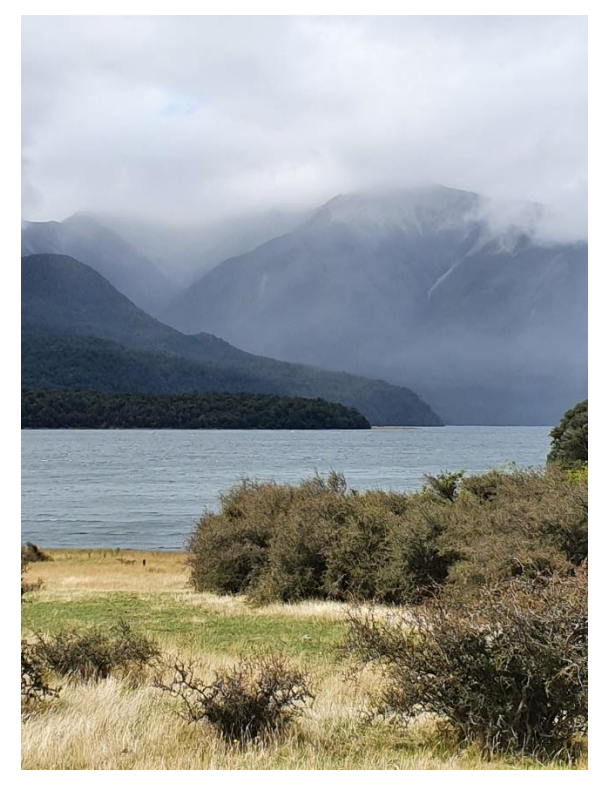
Home Bay, Lake Taylor looking towards Mount Longfellow