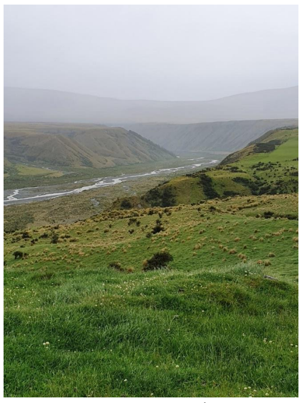
Potts River, Hakatere Conservation Park

The Board's focus for the field trip was to develop a broader understanding of the framework for birdlife/wetland restoration and biodiversity. Wetlands in the park include some of the best examples of red tussock ( Chionochloa rubra ) and Carex secta /pūkio in Canterbury. The park is one of three sites that make up a national wetland restoration programme. An extensive network of kettle hole wetlands, with associated turf vegetation, occurs among moraines and is a rare habitat type nationally. Many threatened turf-forming plants are found here. Through the Ngāi Tahu Settlement Act 1998, a Statutory Acknowledgement and Deed of Recognition is in place over the area to formally acknowledge the association and values \bar{O} Tū Wharekai holds for Ngāi Tahu.