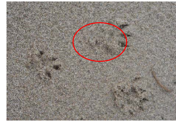
Stoat track (Elongated)