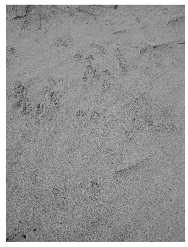
Multiple Rat tracks

Sand is like a giant tracking tunnel and a good place to spot tracks and sign of pest invaders. Look out for tracks along sandy beaches whenever possible. If you see any suspicious looking tracks call 0800 DOC HOT (0800 362 468).