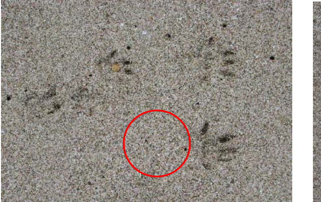
Rat track (Circular)