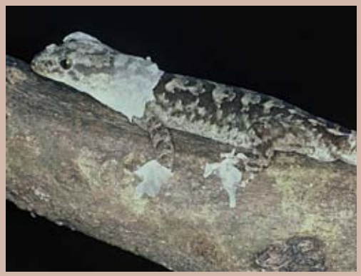
Poor Knights gecko sloughing its skin.

Each year geckos grow new skin and shed their old skin in a process known as sloughing. You may find old sloughed skin under rocks or in retreat sites used by the gecko.