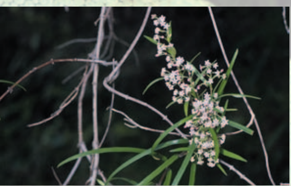
Kaihua, New Zealand jasmine ( Parsonsia capsularis , P. heterophylla )

New Zealand clematis ( Clematis foetida , C. paniculata , C. forsteri )