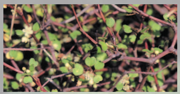
Shrubby tororaro (Muehlenbeckia astonii)

Small-leaved pōhuehue, scrub pōhuehue ( Muehlenbeckia complexa )