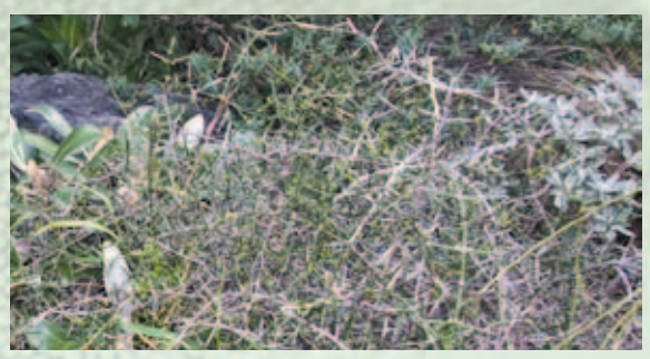
Matagouri (Discaria toumatou)