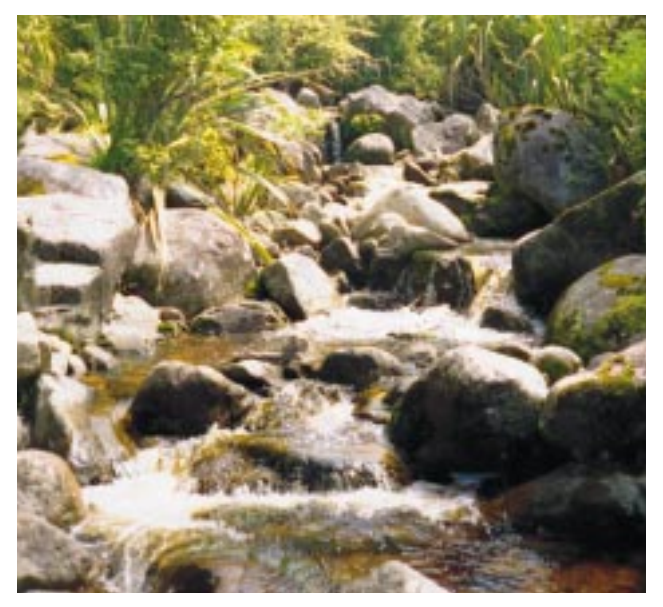
This small stream is home to at least five species of fish

For fish, small streams are as important as large rivers. Streams that some fish choose to live in are so small they can be easily overlooked as habitat for fish. These smaller streams are the usual domain of most New Zealand native freshwater fish, but are also often used by juvenile trout. When viewed collectively, the myriad of small streams throughout New Zealand are house and home to millions of fish. The fish produced and reared in these small streams are the source of valuable fisheries in the rivers downstream.