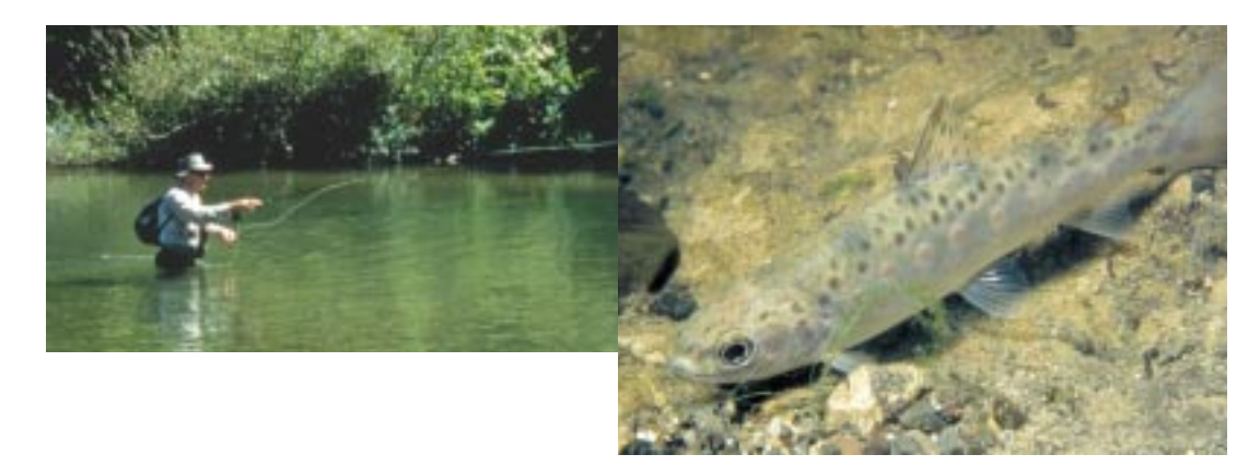
Brown trout (Salmo trutta) juvenile takes shelter in a small shallow tributary.

In this brochure we look at where migratory freshwater fish are typically found and at ways we can ensure that man-made structures in waterways do not prevent them from reaching these habitats.