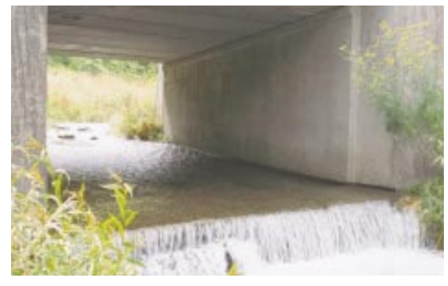
The overhang and level positioning of this concrete bridge apron will prevent most fish from swimming upstream.

If barriers are placed in the way of migrating fish, their choice of habitat becomes limited and this in turn causes a decline in their number. Anytime a simple structure such as a culvert is placed in a stream, there is potential for it to impede fish passage. Bridges generally have the least impact on fish passage because their construction usually does not alter the natural characteristics of the stream. However, even a bridge can impede fish passage if it is boxed or has a concrete apron. Concrete aprons are often left to form overhangs or small falls, which prevent most fish swimming past this point.