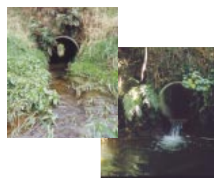
The culvert overhang (at right) will prevent fish passsage. The culvert placed at streambed level (left) provides closer to natural conditions all through its length and allows unrestricted access for fish at most flows.

The best time to consider fish passage is before a structure, such as a culvert, is built or placed in a stream. At this stage, the most important consideration is ensuring the structure has a minimum effect on the natural characteristics of the stream. This is done best by choosing a design that does not create a physical feature in the stream course not there previously. For example, the structure should not create a waterfall where there was previously a gentle meander. If this rule of thumb is followed, there is a much better chance that fish will cope with passage past the structure. Of course this is not always possible because some structures such as dams and weirs are purposely designed to alter a stream's character.