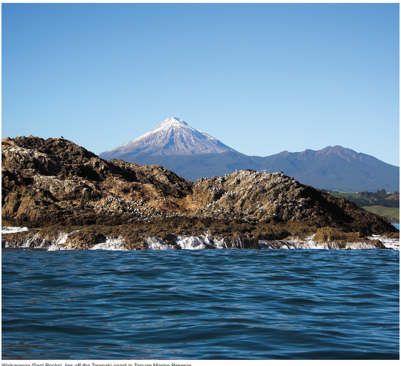
Waikaranga (Seal Rocks), lies off the Taranaki coast in Tapuae Marine Reserve.

In 1990, researchers at Leigh reported that more and larger specimens of the fish popular with fishers (such as red moki, rock lobster and blue cod) had been found in the reserve than outside. At that time, the effects of fishing were thought to be minimal and it was believed that large fish would not stay within marine reserve boundaries. The study provided early proof that fished species could recover in protected areas and helped to interest many people in marine reserve research.