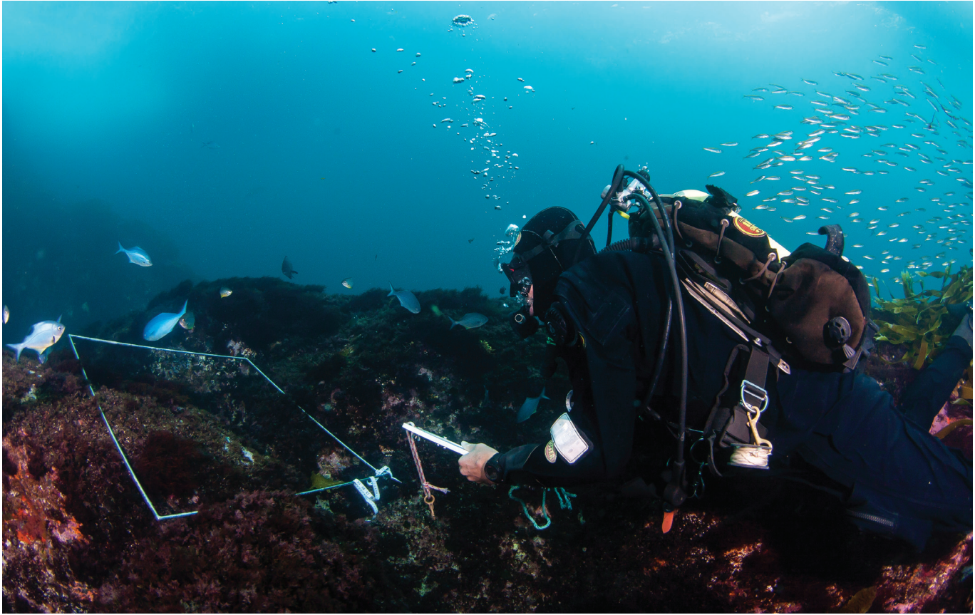
A diver measures the number of shellfish and the seaweed coverage in a 1 metre square sampling area.