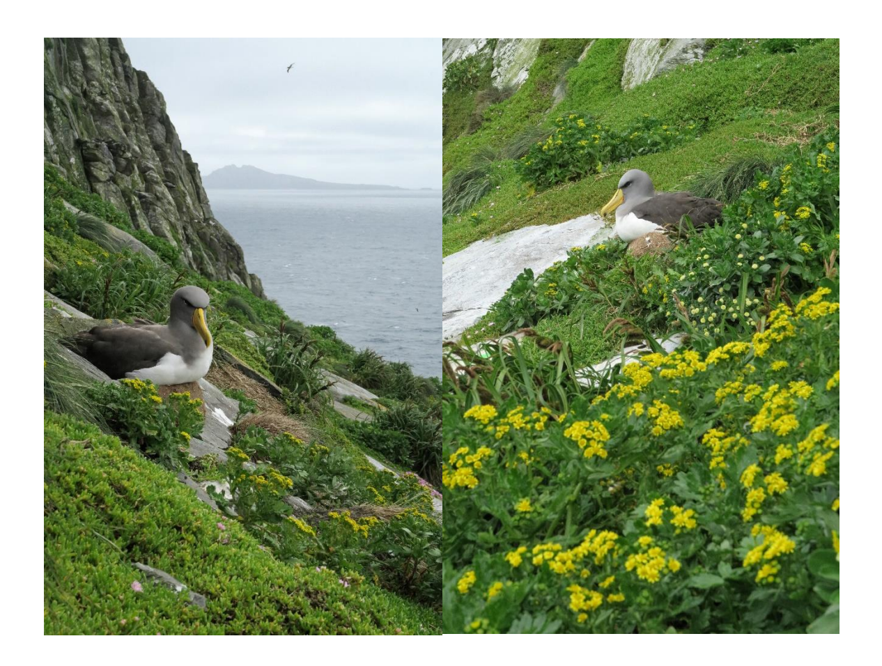
Figure 2. Photos from the North Eastern slopes showing the amount of vegetation cover on the Te Tara Koi Koia, Nov 2016.