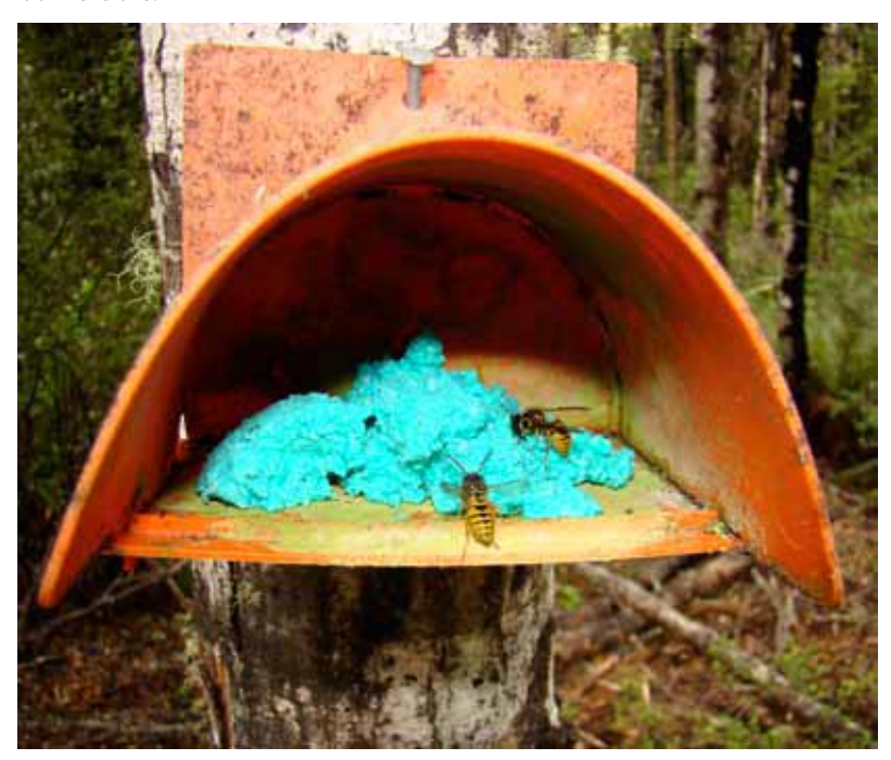
Worker wasps eagerly collect the meat based bait.

We appreciate the continued assistance of Landcare Research in our trials of the wasp toxin X-stinguish<sup>m</sup> (active ingredient - fipronil). The wasp control grid spacing continues to be our focus, aiming to identify optimum spacing between bait station lines so that all wasp nests are vulnerable.