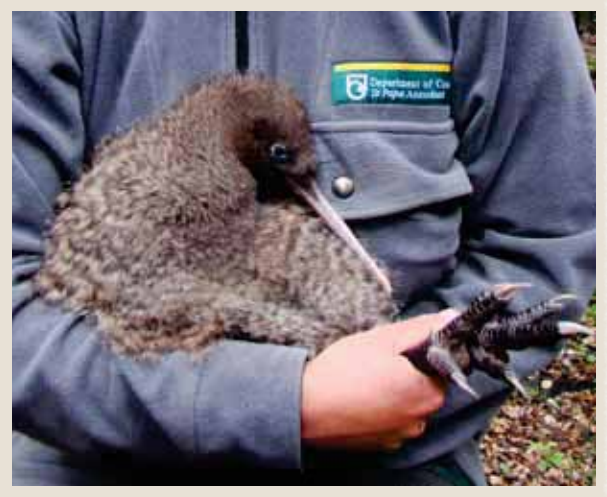
Our latest translocated great spotted kiwi, Hine Kokoiti.

Approved coal mining in the West Coast's great spotted kiwi habitat requires the mining company to safely remove any potentially affected kiwi beforehand. Eggs are collected and hatched at the Willowbank Wildlife Reserve in Christchurch and then the young are released into safe areas including our own RNRP area.