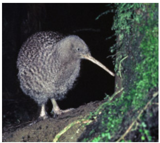
Great spotted kiwi.