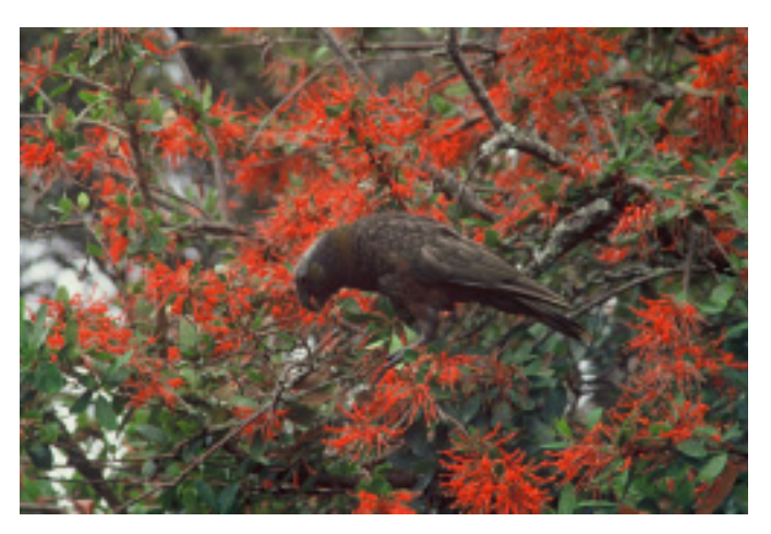
South Island kaka.

Primary schools from around the area are making good use of the resource kit "A Day at Lake Rotoiti". The kit includes activity sheets relating to the interpretation panels on the Honeydew Track in the RNRP area and a selection of word puzzles and games to promote environmental awareness. Most of the primary schools which visit the area are given an introduction to the RNRP by a DOC staff member.