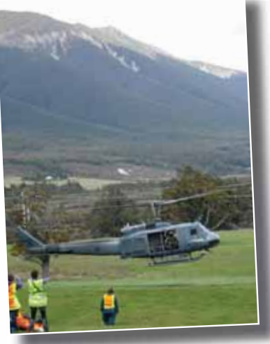
The RNZAF providing Iroquois power to the RNRP.

The RNZAF was in town early in November for various exercises and generously agreed to transport the last of the DOC200 trap boxes to the top of St Arnaud Range. This exercise took three trips by an Iroquois helicopter to deploy 82 traps at four drop off points, saving the staff having to carry these heavy trap boxes thousands of vertical metres. During the following week, the RNRP team and two groups of Conservation Corps volunteers replaced the older, less effective Fenn traps along the lines with the much improved DOC200 model.