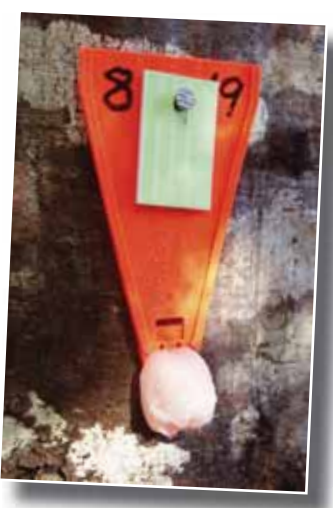
WaxTag® in position nailed 20cm above ground level.

The core 825-hectare area of the RNRP is monitored to gauge the local possum population every three years or so, using another monitoring tool which exploits the inquisitive nature of possums. During June this year, twelve lines of twenty WaxTags® were set out, spaced at 10m intervals. Possums bite the wax tags presumably to see if they are edible.