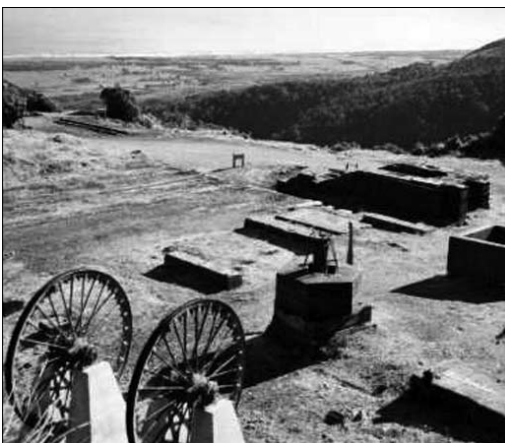
Figure 9. Cable wheels, located near the top of the Denniston Incline, West Coast.

The photo shown in Fig. 9 was taken in 2002 near the top of the Denniston Incline, with the Tasman Sea in the background. One of the advantages of the West Coast climate is that items such as the cable wheels on display are regularly rain-washed. Because they are exposed and have few crevices and low mass, they also dry out rapidly when mounted clear of contact with soil or wet vegetation.