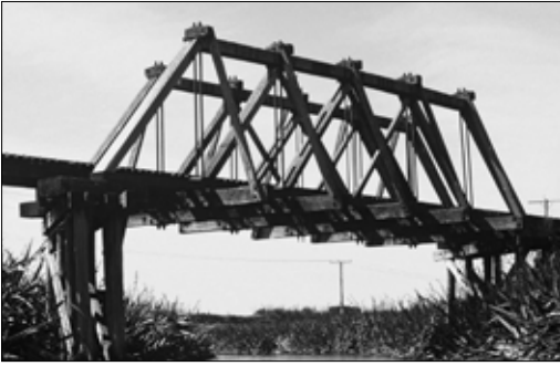
Figure 13. 'Howe Truss' bridge, West Coast.

This 'Howe Truss' bridge (Fig. 13) is located 5 km south of Hokitika and just 250 m from the sea. It was built in 1905 with steel bottom chords and iron truss rods, and was refurbished by the Department of Conservation (DOC) in April 2000. The following system was used for restoration: all exposed metalwork was abrasive blast cleaned to a 'near-white' finish (Sa 2½), primed with 75 µm of an epoxy zinc-rich primer, and top coated with 200 µm of an epoxy-mastic. The work was carried out by Gray Bros Engineering of Greymouth under the supervision of Jim Staton (then at Hokitika Area Office, DOC), using paint material and inspection services supplied by International Protective Coatings.