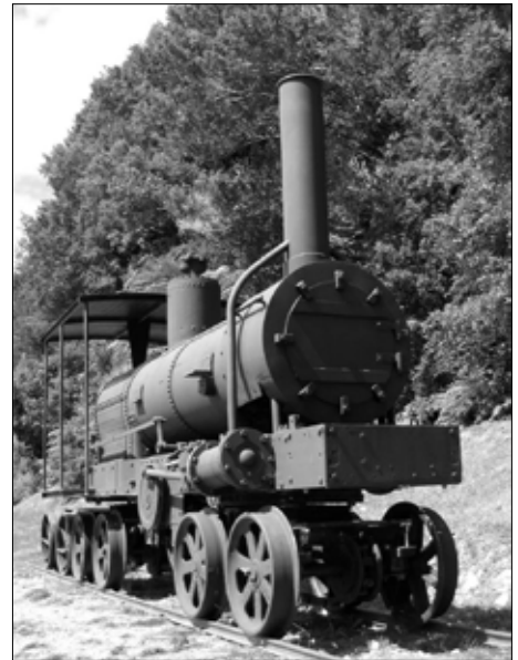
Figure 15. The refurbished Davidson Locomotive.

The Davidson Locomotive (Fig. 14) is thought to be the only surviving example of a locally built (i.e. at Hokitika) steam locomotive that was used on bush railways near Greymouth. Like the Mahinapua Creek bridge, this was also refurbished by Gray Bros Engineering in Greymouth under Jim Staton's supervision. After earlier attempts at painting with epoxy mastic (see Fig. 4), the locomotive was fully dismantled and new parts were fabricated where required. All of the metalwork was then abrasive blast cleaned, coated with 80 µm of zinc metal applied by arc spray, and finished with 120 µm of high-build epoxy (supplied by Altex Coatings). The end result is shown in Fig. 15.