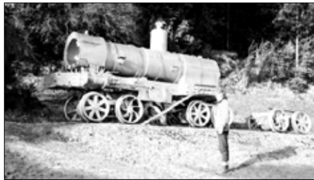
Figure 14. The Davidson Locomotive before restoration.

The Davidson Locomotive (Fig. 14) is thought to be the only surviving example of a locally built (i.e. at Hokitika) steam locomotive that was used on bush railways near Greymouth. Like the Mahinapua Creek bridge, this was also refurbished by Gray Bros Engineering in Greymouth under Jim Staton's supervision. After earlier attempts at painting with epoxy mastic (see Fig. 4), the locomotive was fully dismantled and new parts were fabricated where required. All of the metalwork was then abrasive blast cleaned, coated with 80 µm of zinc metal applied by arc spray, and finished with 120 µm of high-build epoxy (supplied by Altex Coatings). The end result is shown in Fig. 15.