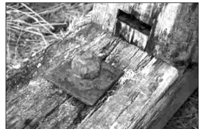
Figure 6. A steel washer on the 'Come-in-Time' stamper battery in the Bendigo Reserve Area, Central Otago.

The Central Otago environment is at the lower end of the scale of corrosivity. Figure 6 shows mill scale on a steel washer on the 'Come-in-Time' stamper battery in the Bendigo Reserve area, which is still largely intact after over 100 years. At this site, corrosion is much less of a problem than the theft of components that can be carried away.