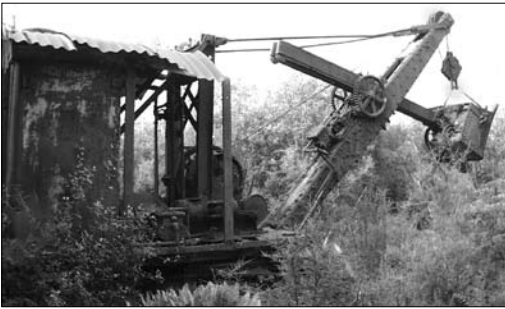
Figure 7. The Haupiri steam shovel, West Coast.

The Haupiri Steam Shovel is a current conservation project on the West Coast. Since the time of the photograph (Fig. 7), the surrounding vegetation has been removed and the steam shovel is now being treated each year with Ensis oil, which is a short-term preservative. This short-term measure will continue until funding for a longer term protective treatment is available.