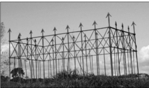
Figure 12. Urapa fence, Te Rua O Te Huia Pa Reserve, Onaero, Taranaki.

Figure 12 shows a historic Maori grave site on the Te Rau O Te Huia Pa Reserve at Onaero, 30 km east of New Plymouth. The grave fence is said to be an early example of prefabricated wrought iron dating from the 1860s that may have originated in Australia. Most of the metalwork is still in reasonable condition, but there has been severe corrosion and loss of section at ground level where it is usually damp. It has been recommended that a concrete plinth be cast around the base to protect the remaining ironwork.