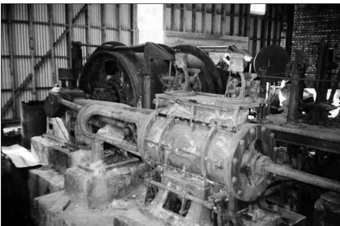
Figure 2. Robey winding engine at the Big River Mine.

Moisture can be prevented from contacting the surface in a number of ways. The ultimate solution is to relocate the iron and steel into a dry environment or build an enclosure around the item, as was done for the Robey winding engine at the Big River Mine, just south of Reefton (Fig. 2). However, in coastal locations, shelters that are not fully enclosed can actually accelerate corrosion by preventing rain from washing wind-borne marine salts from contaminated surfaces.