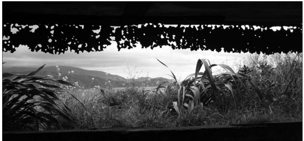
Figure 5. View from the Fort Dorset Observation Post out to Pencarrow Head Lighthouse, Wellington.

This site is a classic example of severe corrosion of structural elements on which protective coatings have not been maintained, located close to the sea and in a sheltered micro-environment where wind-borne salts are not removed by rain-washing.