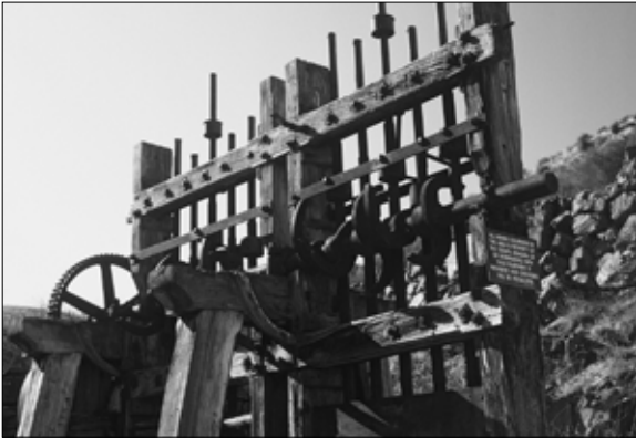
Figure 1. Stamper battery, Bendigo Reserve, Otago.

by the contact of ferrous metals with air and water, and which is powered by the energy released from the conversion of iron back to its natural form as iron ore or rust. Mild steel corrodes more rapidly than wrought iron and cast iron, as more energy is used in its manufacture.