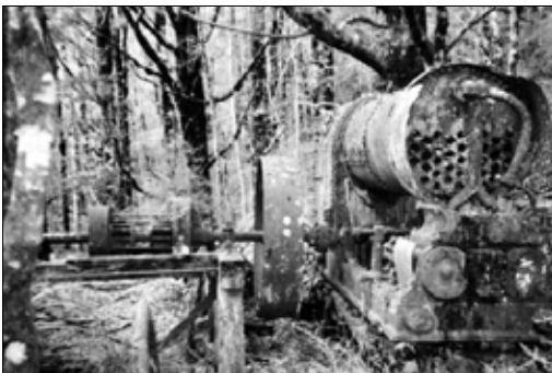
Figure 8. The patent Robey fixed engine.

Even more of a challenge for preservation is the Robey semi-portable underslung sawmill engine (Fig. 8), which used to provide power for the Golden Lead Creek Sawmill. This sawmill produced timber for the nearby coalmines and the Big River Quartz Mine. The engine's remote location (c. 24 km south of Reefton near the end of the Big River Road) has preserved it from scrap metal merchants and souvenir hunters.