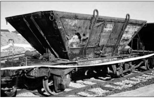
Figure 10. 'Q-wagons', Greymouth.

Figure 10 shows an example of 'Q wagons', which are now exhibits in a heritage park in Greymouth. They were lifted off the bogies when they reached the wharf and had a bottom outlet for emptying into the ship. Some of the original bituminous coating provides protection in places but, as can be seen, some of the thinner sheet material has already corroded away, as a result of contact with wet coal.