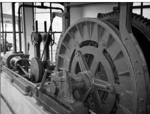
Figure 11. Restored winding engine, Reefton Visitor Centre, West Coast.

As an example of what can be done, Fig. 11 shows a restored winding engine, which is located in the Reefton Visitor Centre. It is now protected from the damp and salty West Coast environment (and damage by vandals) by a full enclosure and a simple protective coating system using alkyd paint.