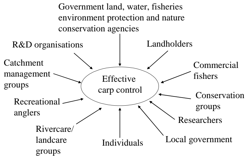
Figure 2. Stakeholders in carp management in Murray–Darling Basin.

The expected outcomes of the CCCG were the: