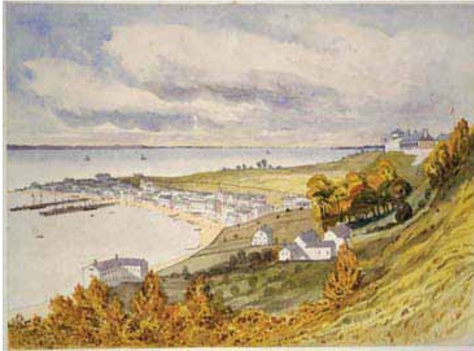
Premier William Fox painted Fort Michilimacknac during his visit to the United States in 1853. The British built the fort site during the American Revolution and it was one of the early national monuments. The island park is now a state park and there are five historic buildings associated with the fur-trade era. ALEXANDER TURNBULL LIBRARY: William Fox, 1853, WC-251