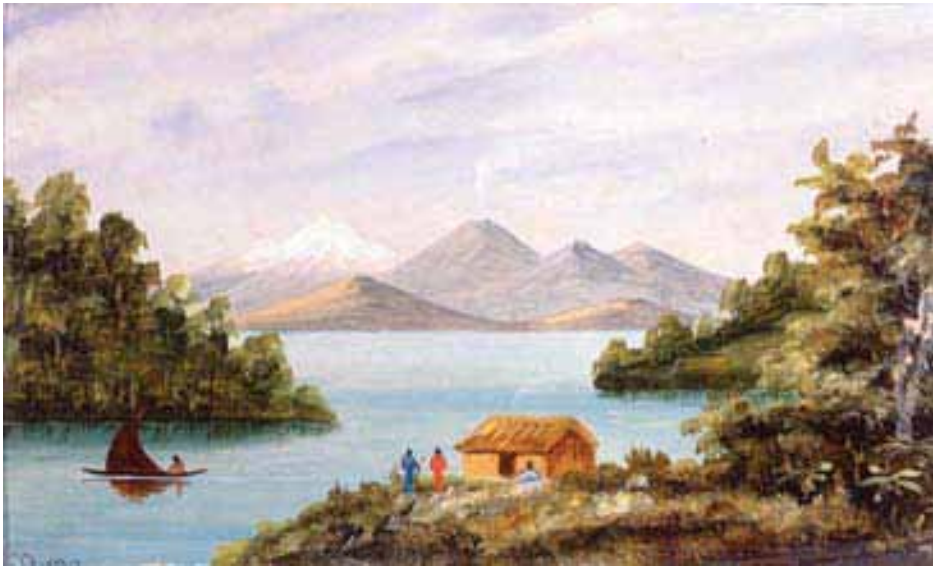
John Backhouse painted this romantic view of Lake Taupo in the 1880s. The scene seems an unlikely one with a clear view of all three main volcano peaks: Tongariro, Ruapehu and Ngauruhoe, now part of the Tongariro National Park and World Heritage Cultural Landscape. ALEXANDER TURNBULL LIBRARY: John Philemon Backhouse, 1880s, G-452-1-1