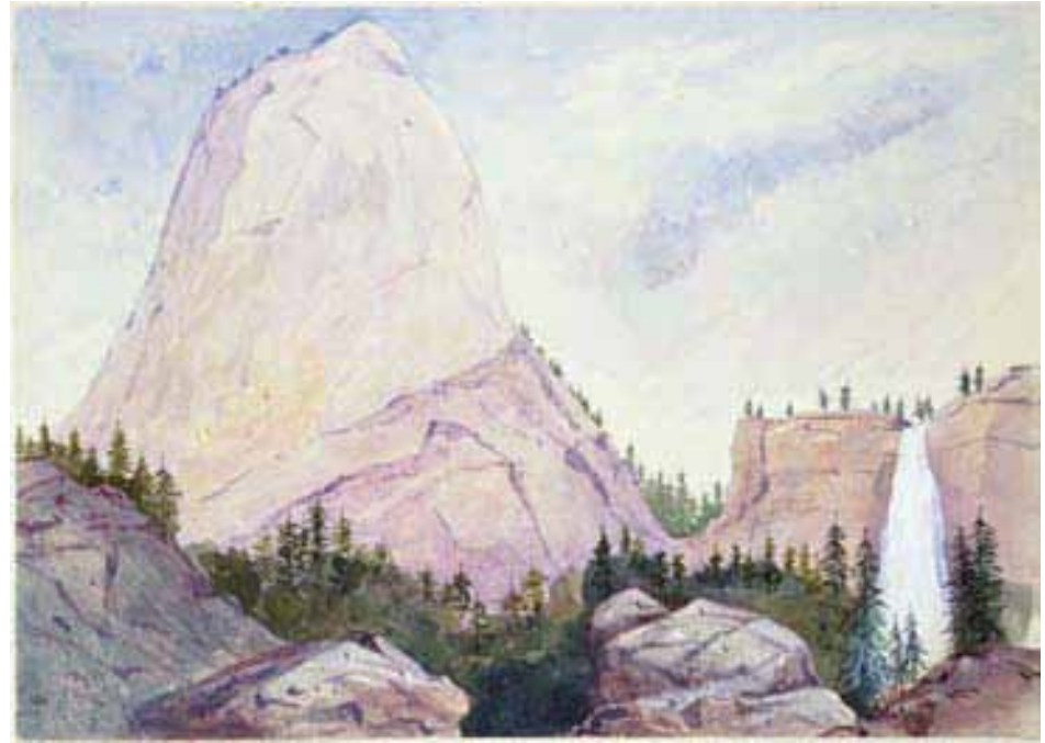
The Cap of Liberty at Yellowstone, California. ALEXANDER TURNBULL LIBRARY: William Fox, 1853, WC-222

From 1840 on, there had been reserves created in New Zealand for public recreation areas and domains. The Land Amendment Act 1884 permitted the establishment of reserves for mineral springs and 'natural curiosities'. The earliest reference to scenery in legislation was in the Land Act 1892. However it was only with the