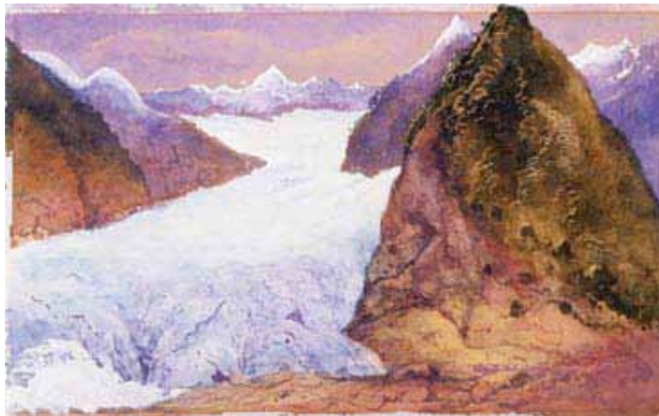
William Fox painted the glacier named after him—Fox Glacier (Te Moeka o Tuawe at Weheka)—in 1872. The five-time premier was an extensive traveller who painted scenic wonders in the United States, Middle East, Europe and the Caribbean. Fox Glacier was made a scenic reserve in 1930. It was one of those incorporated into the Westland National Park in 1960 to commemorate the centennial of the Westland Province. It is now part of Te Wahipounamu—a World Heritage site designated in 1990.