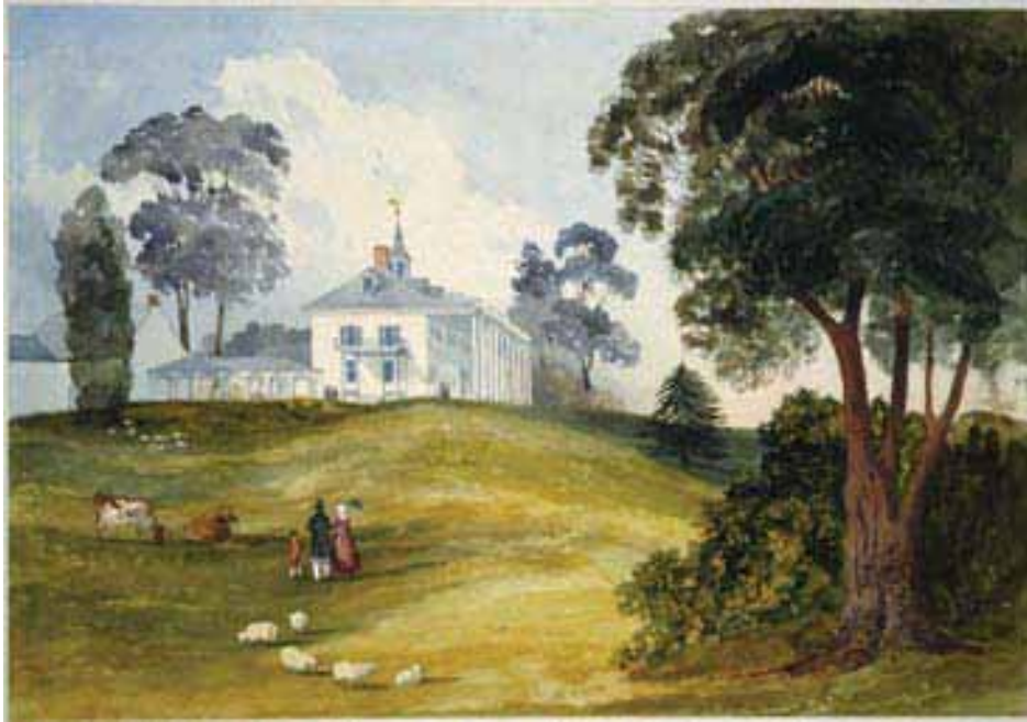
Mt Vernon, the home of George Washington, was an early national monument.