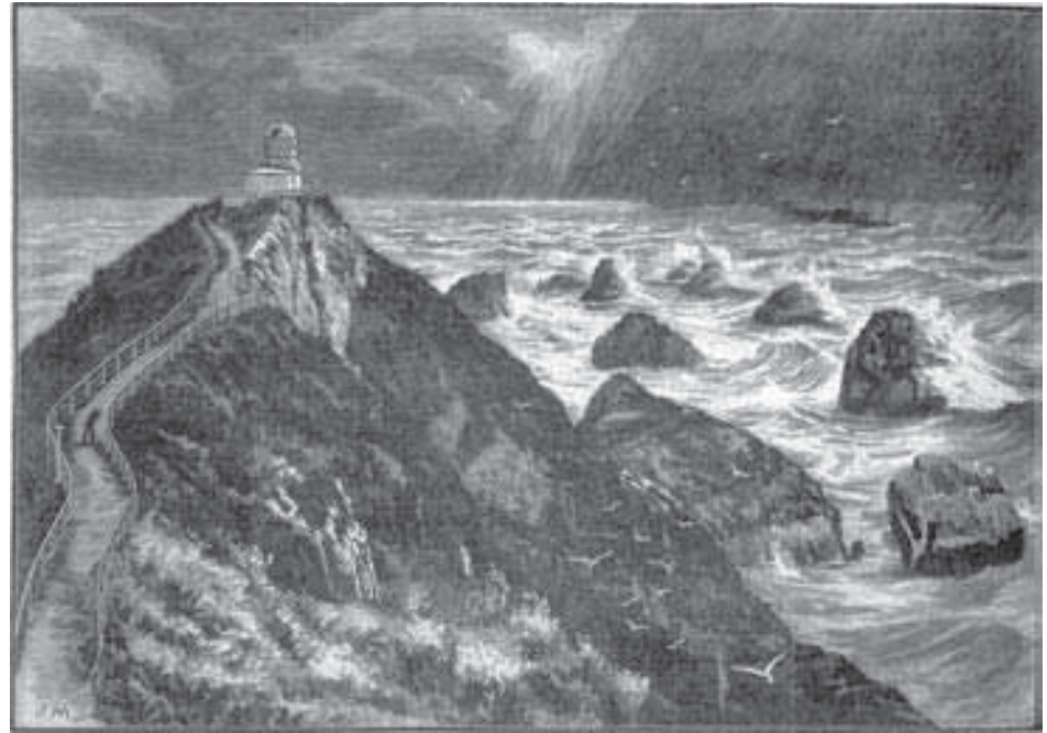
Nugget Point Lighthouse. Illustrator: JM, Illustrated New Zealand News , 31 August 1885, p. 7; ATL: C-26575-1/2

Geothermal areas were special places for many Europeans, both as scenic wonders and health resorts. The pink and white terraces at Tarawera had been internationally renowned by the time of the 1886 eruption. The loss of those attractions was deeply felt. Many of the painted images we now see of the terraces are romantic death masks. The Crown determined to purchase and protect public access to such areas even if it could not preserve them against overwhelming natural disaster. 🌊