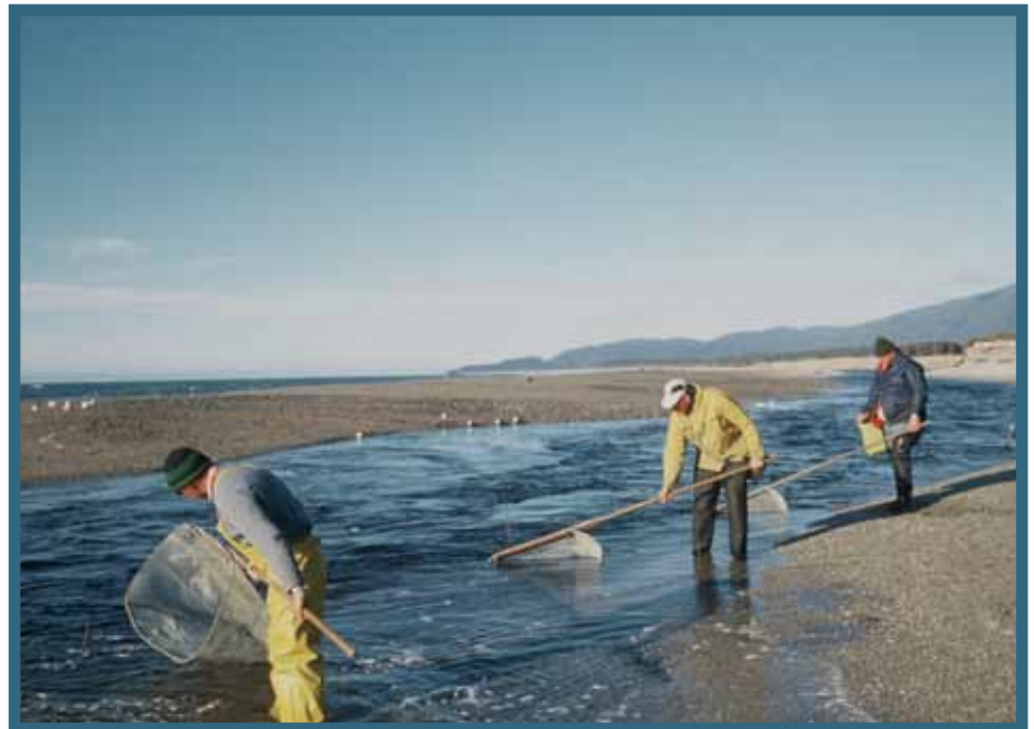
Crown copyright. Department of Conservation, Te Papa Atawhai (2002)

That means cleaning your nets and other gear between waterways during whitebait season to help prevent the spread of freshwater pests such as didymo ( Didymosphenia geminata ) and oxygen weed/lagarosiphon ( Lagarosiphon major ).