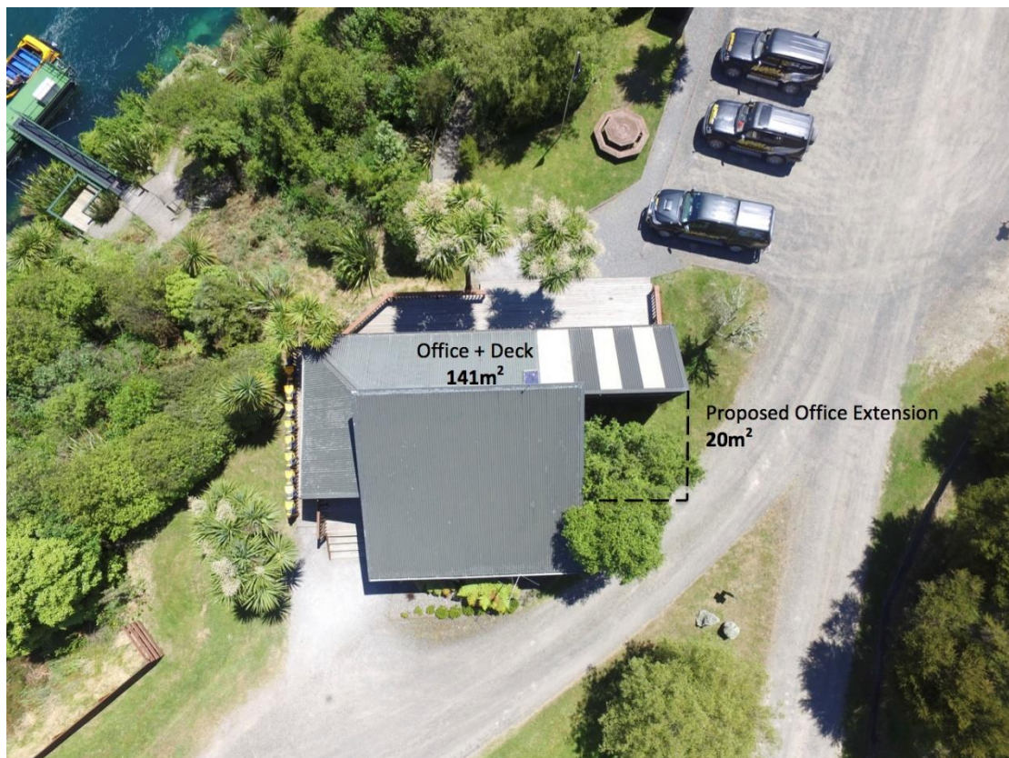
Proposed extension to the visitor centre