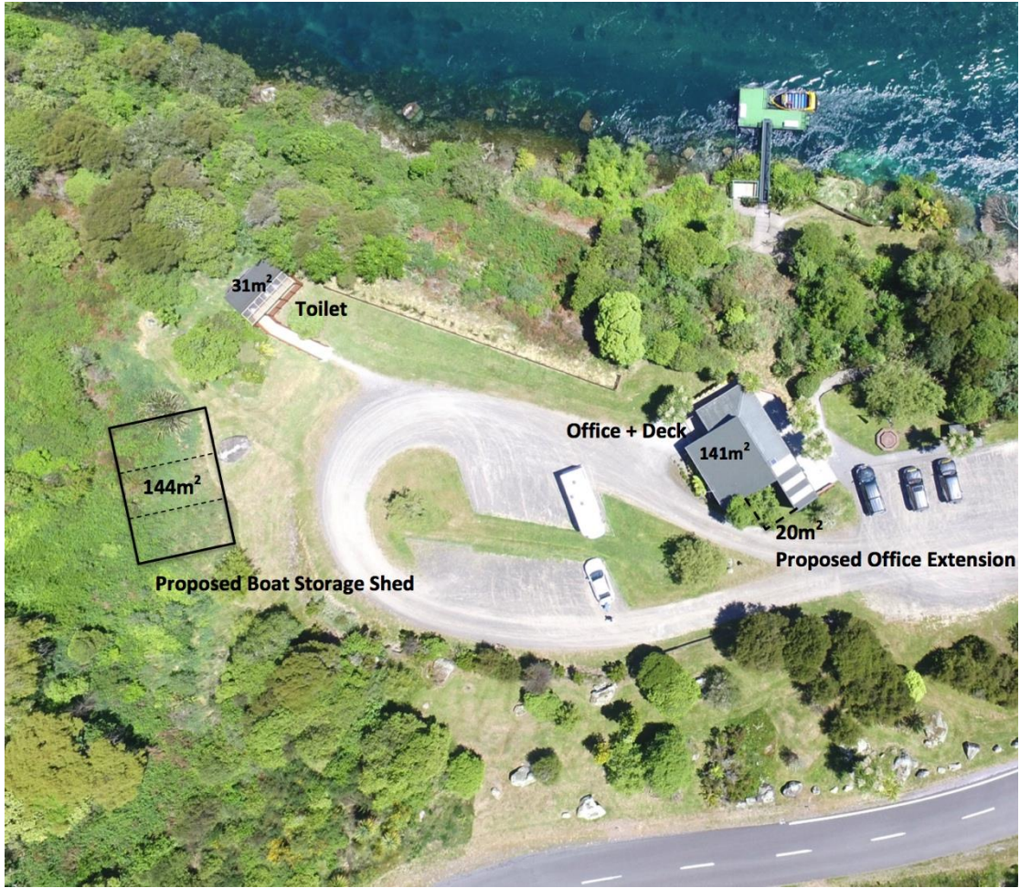
Proposed location of the new boat storage shed