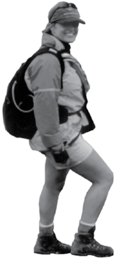
Be ready for any conditions.

Visit the Department of Conservation website: www.doc.govt.nz