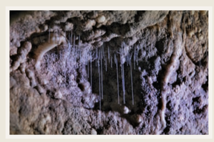
Glow worm/titiwai threads (Dawn Patterson)

The Clifden Caves provide a natural habitat for the glow worm, which requires a damp environment with little or no wind.