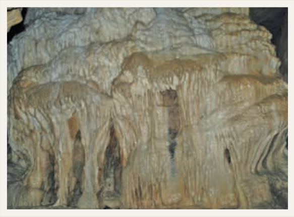
Calcium formations in the cave (Dawn Patterson)

Limestone caves form over a long period of time when acidic groundwater seeps through cracks in the rock and dissolves the calcium carbonate in the surrounding limestone. This creates passageways and unusual formations such as stalactites and stalagmites that gradually become larger and form cave systems.