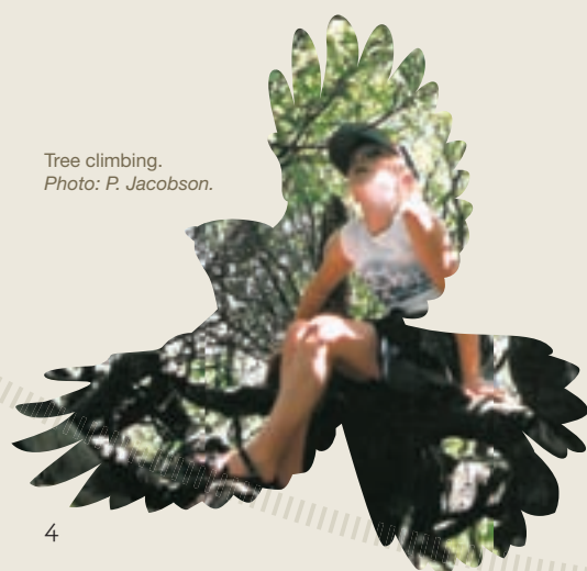
Tree climbing.