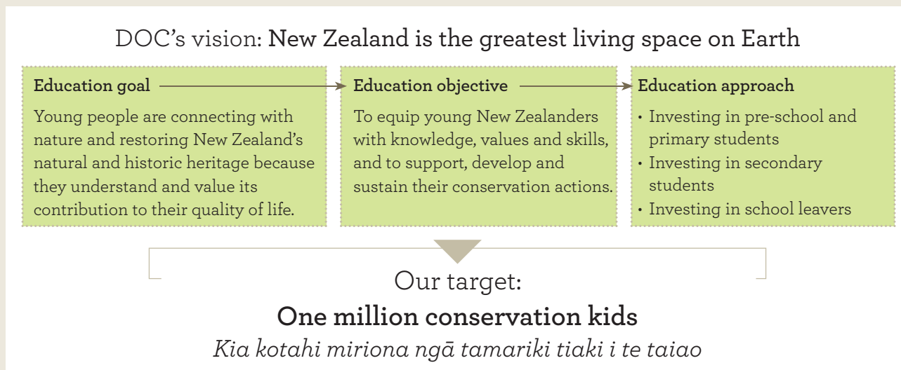
FIGURE 2. STRATEGY VISION, GOAL, OBJECTIVE AND APPROACH.