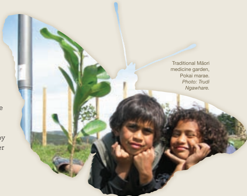
Traditional Māori medicine garden, Pokai marae.

People of all ages, life stages and backgrounds have the opportunity to learn about and extend their skills in conservation through a variety of training, volunteering and outreach programmes provided by the Department of Conservation (DOC) and partner organisations.