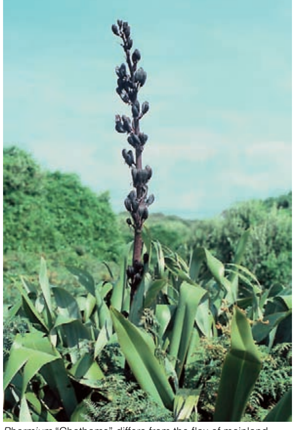
Phormium "Chathams" differs from the flax of mainland New Zealand in having more robust features, low leaf fibre and a distinctive yellow and red edge on younger leaves.