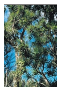
Tarahinau ( Dracophyllum arboreum ).