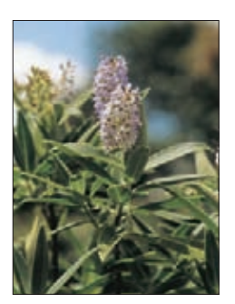
Tree koromiko ( Hebe barkeri ).