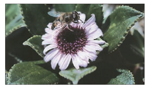
Leaves of Chathams species are also often fleshier and trees bigger than their New Zealand counterparts. Chathams plants do not generally show juvenile forms.

Most well known of the endemics are Chatham Island forget-me-not (Myosotidium hortensia), rautini (Brachyglottis huntii), Chatham Islands kakaha (Astelia chathamica) and soft speargrass (Aciphylla dieffenbachii). Plants of the Chathams show a much higher proportion of coloured flowers than in mainland New Zealand. Examples are Chatham Island forget-me-not (blue), linen flax (Linum monogynum var. chathamicum, blue), Chatham Island geranium (Geranium traversii, pink), swamp aster (Olearia semidentata, mauve), keketerehe (O. chathamica, purple), and giant sowthistle (Embergeria grandifolia, purple).