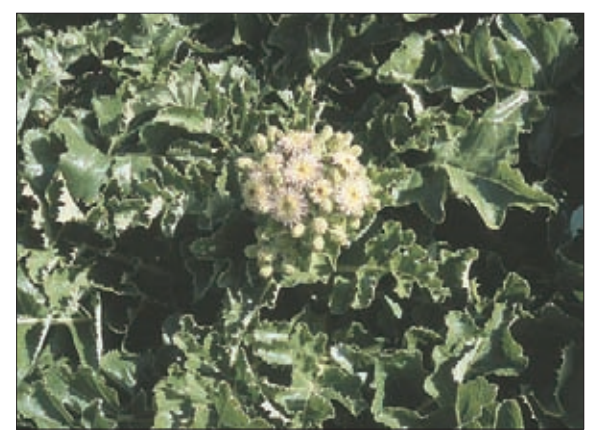
Giant sowthistle ( Embergeria grandifolia ).

Other species have developed giant leaves e.g., megaherbs such as Chatham Islands forget-menot and giant sowthistle ( Embergeria grandifolia ). Gigantism is also displayed by the trees and shrubs. Chatham Islands karamu ( Coprosma chathamica ), which grows into a forest tree, is by far the largest species in a genus of shrubs. Tree koromiko ( Hebe barkeri ) is also the largest of its genus and akeake ( Olearia traversii ) is one of the largest tree daisies on earth. Button daisy ( Leptinella featherstonii ) is a woody shrub—all other members of its genus are creeping herbs. These significant enlargements may be due to the climate, long isolation and high soil fertility.