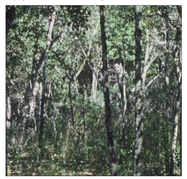
The forest is regenerating well in reserves where the harmful effects of introduced animals are controlled.

Before widespread clearance, over 90 percent of the islands were covered with a mosaic of forest types with scrub and rush swamps covering the balance of the area. However, sufficient remains of the natural character of the Chathams to be apparent almost everywhere. The network of protected areas on the main islands contains much of the representative fauna, flora and habitats, and more is being added steadily through the interest and generosity of landowners. Enhanced conservation management in recent years, is resulting in an increasing quality of natural habitat—through the removal of weeds and possums and fencing out stock, and the restoration of populations of threatened plants.