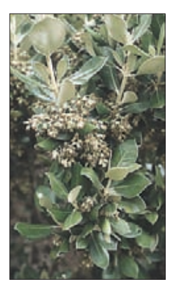
Akeake (Olearia traversii).