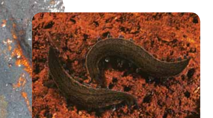
Peripatoides sp. 'Mt Peel'