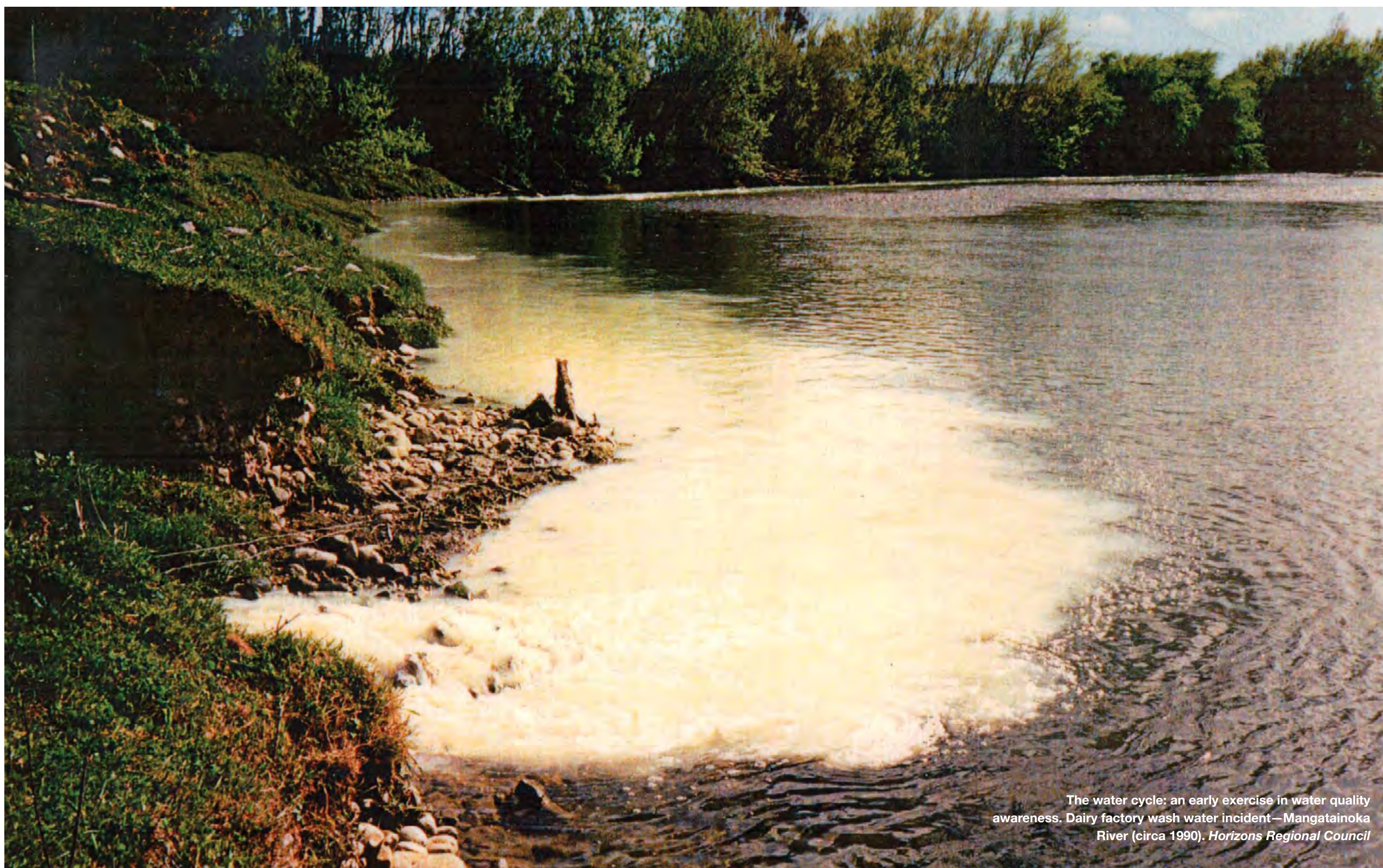
The water cycle: an early exercise in water quality awareness. Dairy factory wash water incident—Mangatainoka River (circa 1990). Horizons Regional Council