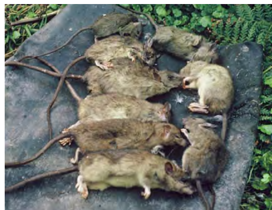
Big South Cape: its 1964 infestations transformed island predator control. Image database DOC

less than 50 years ago, these scientists held that habitat was what mattered, that exotic predators such as rats could not eliminate a native species.