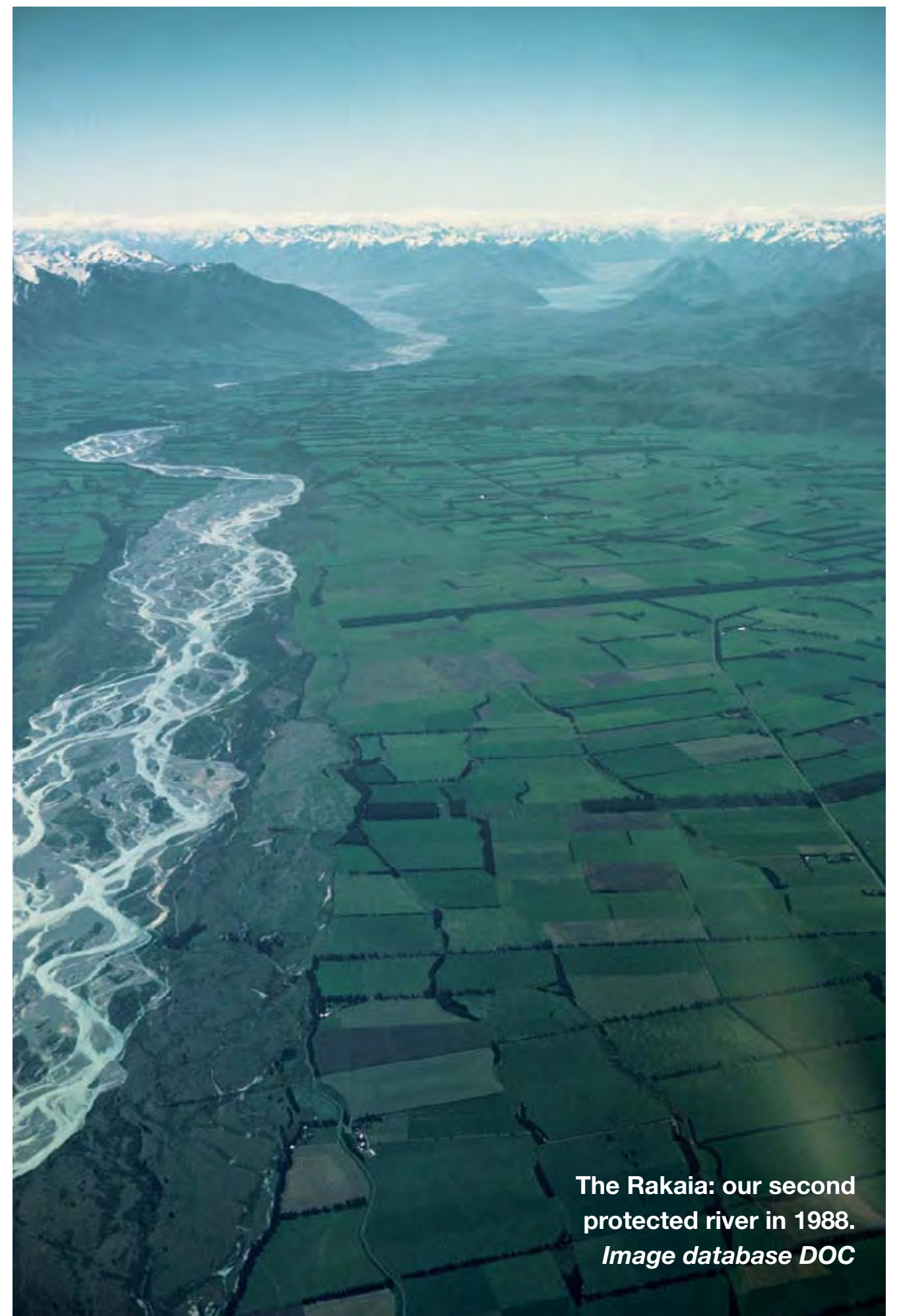
The Rakaia: our second protected river in 1988.

By legislative amendment, statutory bodies were able to nominate a river, or river section for designation, as nationally or locally outstanding. If, after a robust independent tribunal process, a river was found to be outstanding, the obligation was to determine what measures were required to preserve or protect those features. A recommendation went to the Minister for the Environment. This process