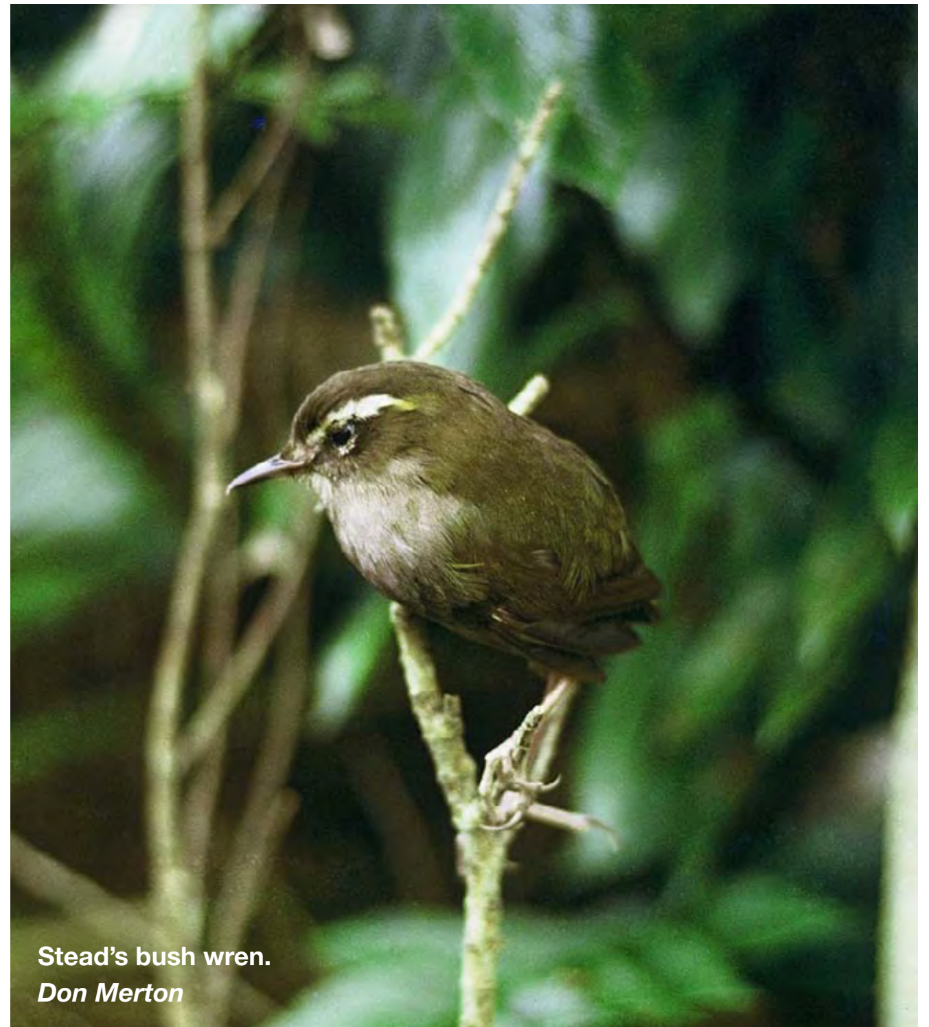
Stead's bush wren.