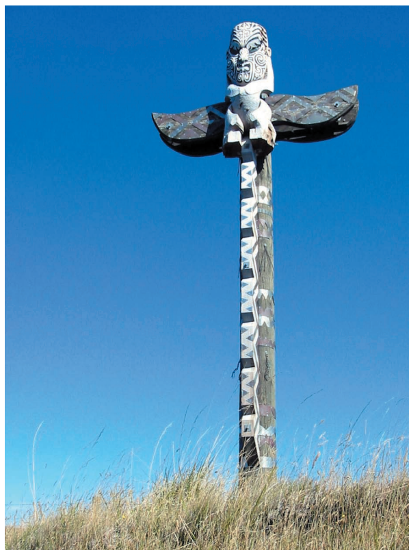
Rahui Pou, overlooking Te Tapuae o Rongokako Marine Reserve; it was erected by Ngati Konohi for the opening of the reserve in November 1999

The report also contributes towards the second stage of the community research project which involves developing, monitoring and reporting on Ngati Konohi's tohu for the rohe moana.