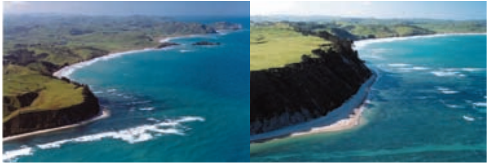
Kaiora Pa looking north to Whangara

Kia whakanuitia, kia manaakitia, te oko a Tangaroa mo nga mokopuna e whai ake nei