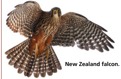
New Zealand falcon.