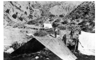
Musterers' camp in the Clarence Reserve.