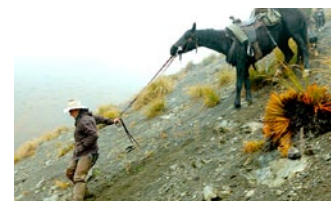
Descending Robinson Saddle.