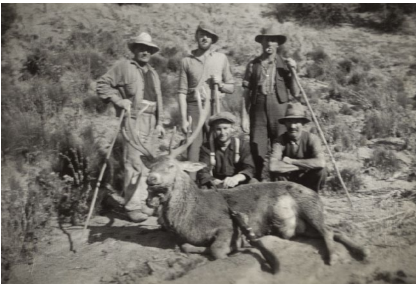
Proud group of musterers with 'nibbies' (walking poles) and catch of the day on Molesworth.

It appears the name Clarence was around prior to 1849 but whether it was named after the Duke of Clarence, the Clarence River in New South Wales, Australia or another source, no one seems to know. In his report on the trip along the coast from Lyttleton to Flaxbourne, as reported in the Lyttleton Times March 1851, Frederick Weld commented on being taken up the coast by whaleboat from the whaling station at Waipapa to be landed on the northern side of ... "a rapid and dangerous river, which flows between the 'Lookers-on' and the inland Kaikouras, and here falls into the sea; it has been variously named, as the Waipapa, the Big River, and the Clarence, which name appears the most euphonious and easily remembered". Weld was right in that it was the name that stuck. The Māori name for the river is Waiau-toa.