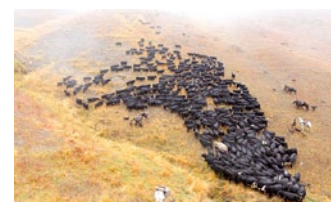
Ascending Robinson Saddle.