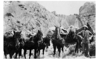
Pack horses amongst the limestone bluffs of the Clarence Reserve.