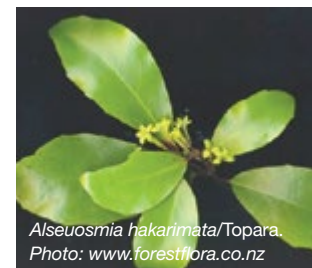
Alseuosmia hakarimata/Topara.

Large rātā and rimu can occasionally be seen along the crest and ridges of the Hakarimata Range, towering over the canopy of tawa, kohekohe, hīnau, rewarewa, mangeao and pukatea. There are also pockets of miro, Hall’s tōtara and tanekaha. The large kauri seen on the Kauri Loop Track is of special interest as kauri of this size (7 m girth) are rare in the Waikato area. The reserve also contains a number of threatened plants including the strongly scented daphne Alseuosmia hakarimata or topara.