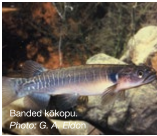
Banded kōkopu.