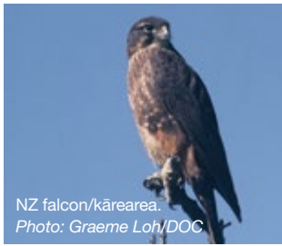
NZ falcon/kārearea.

As well as the more common forest birds such as tūī, kererū (also known as kūkū or New Zealand wood pigeon), fantail and shining cuckoo, there are nationally threatened kārearea (native falcon), pekapeka (long-tailed bat), skinks and geckos found on Hakarimata. The reserve also contains over 122 different species of native land snail and the ancient peripatus.