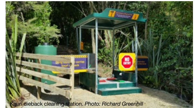
Kauri dieback cleaning station.

At the summit, it is possible to exit the walkway down to Brownlee Avenue (1 hr) or continue the full length to Waingaro Road via the Rail Trail (another 2 hr 30 min). Transport needs to be arranged for the end of the walkway.