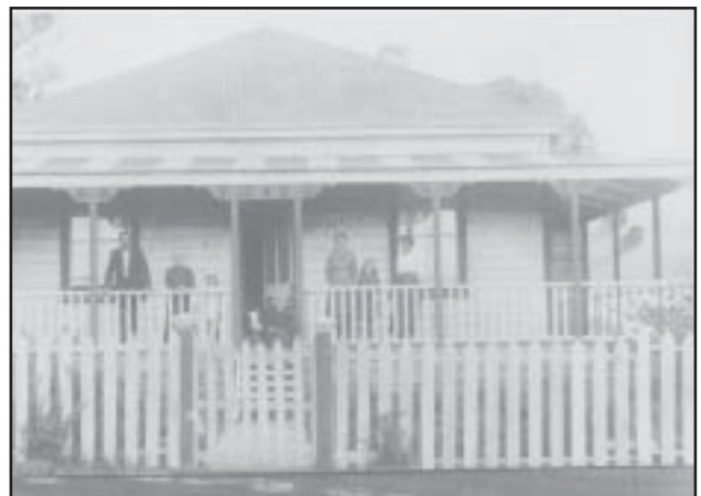
Harataonga homestead.

A number of ships have been wrecked on Great Barrier's rugged coastline. One of the worst shipwrecks in New Zealand's maritime history was that of the SS Wairarapa , which struck rocks near Miners Head just after midnight on 29 October 1894. About 140 drowned and Great Barrier Island's remote location made the job of rescuing the survivors difficult. Most of the dead were brought back to Auckland, but some remain buried on the island in two small cemeteries that can be visited at Onepoto and Tapuwai historic reserves.