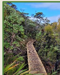
Track Section J (upper left). Track Section A (main). Track Section C (lower left).