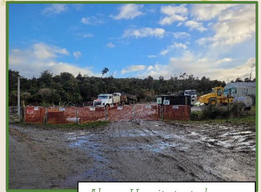
Above: How it started ... Below: How it was going ...

Thank you everyone for the patience and understanding during this busy, disruptive time - especially local road users, landowners and Rowallan Alton farming and Rarakau Lodge teams. It will be worth it!