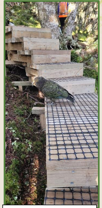
A local inspecting the boardwalk construction.

With many hands, the job will be finished