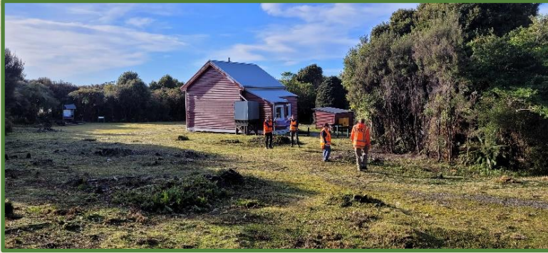
The project team, at Port Craig Schoolhouse, scoping the site placing of the interpretation signs and structures.