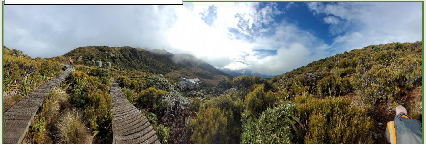
A panoramic view of the project team, above Okaka Hut, planning the placement of new signage. Look at that skyline!