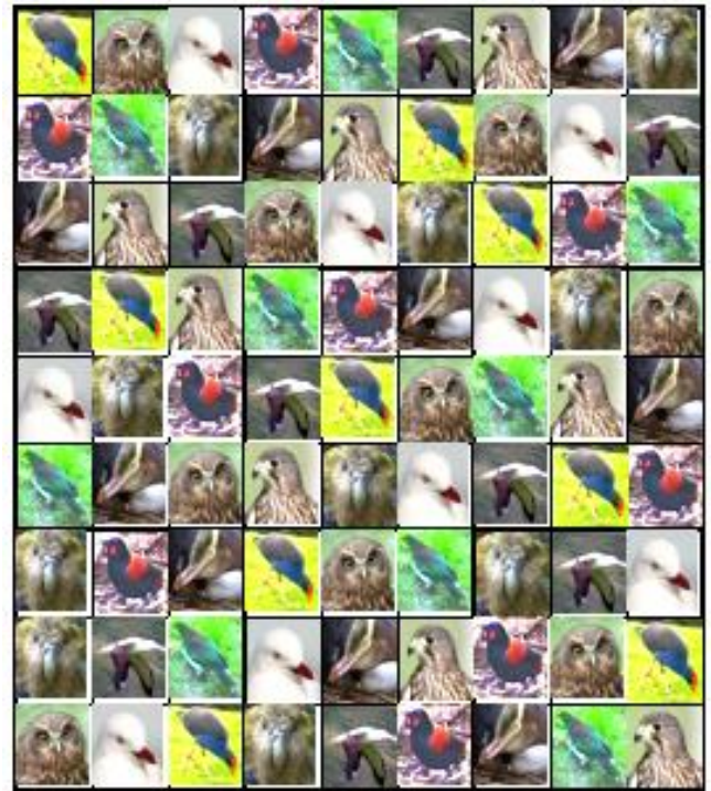
Answer to previous Sudoku puzzle